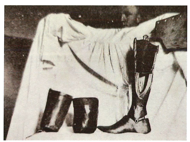
(An example of the "Fort Des Moines Leg." Retreat: The Fort Des Moines Post Hospital No. 26 held at Des Moines Public Library)

Part of this rehabilitation included fitting soldiers with prosthetics, especially for amputated legs. The government-issue leg prosthetics were slow to arrive and often ill-fitting so the orthopedics workshop at Fort Des Moines No. 3 came up with their own design, which was quicker to produce, cheaper, more durable, and easier to fit. The innovative prosthetics became known as the "Fort Des Moines Leg." Convalescing soldiers were also treated for the mental distress they endured in battle. Harsh, outmoded treatments for "battle fatigue" were set aside in favor of more holistic neuropsychological treatment. This included occupational therapy and vocational training along with diversions and entertainment provided by the Red Cross and other agencies that served the Fort.