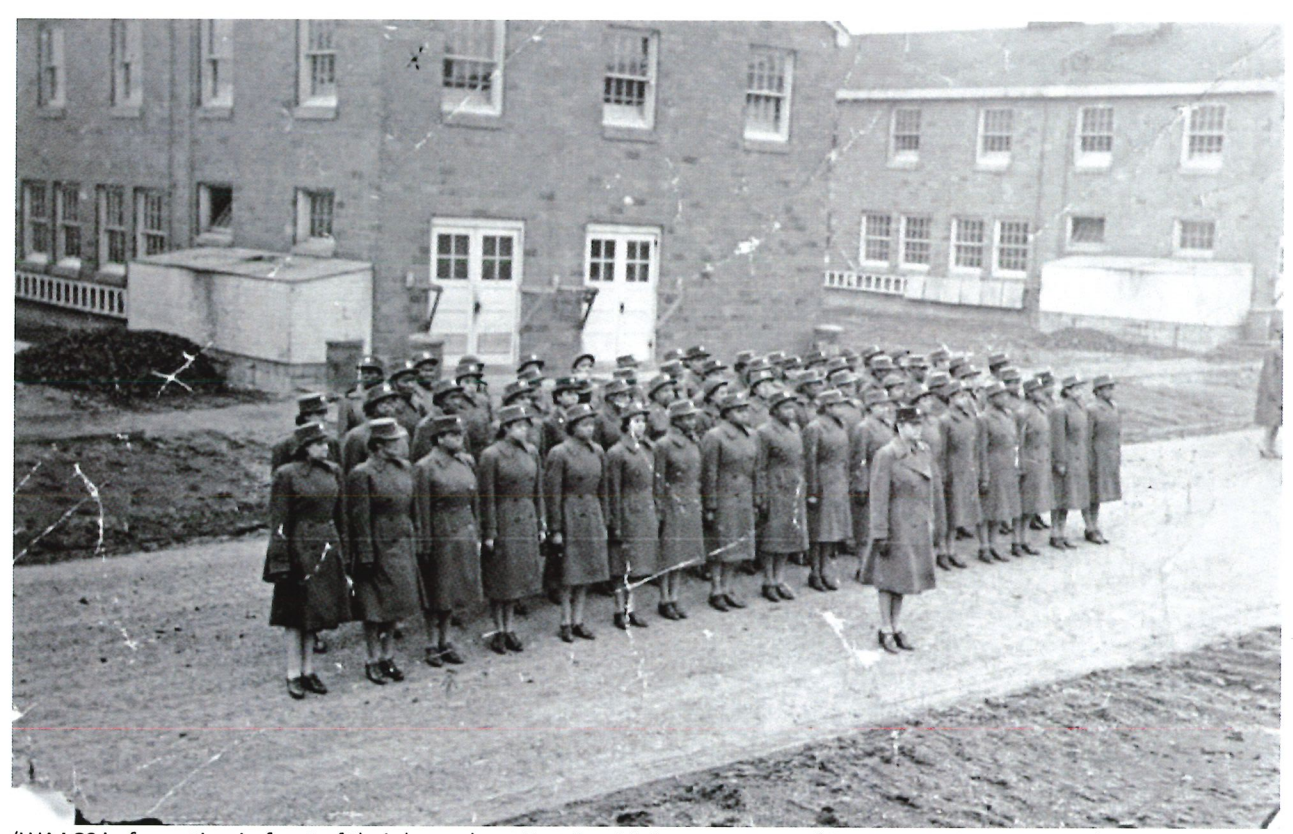
(WAACS in formation in front of their barracks at Fort Des Moines)

In May 1942 Fort Des Moines No. 3 became the site of the first Womens Auxiliary Army Corps (WAAC). Four hundred forty women were chosen for the officer training program and 330 women began a shorter course as privates. Forty of the initial officer class were black women. Major (later Colonel) Olveta Culp Hobby directed the WAAC through training in noncombatant positions such as clerks, drivers, cooks, machinists, and messengers. The program expanded as the war continued and WAAC trainees freed up men in noncombatant roles to go to battle. WAACs also went on to train in the Army Air Corps. Fort Des Moines No. 3 was the largest WAAC training center and the only one to provide officers training. In all, over 70,000 women went through the First WAAC training center. In July 1943 the "Auxiliary" status of the WAACs was dropped and the Women's Army Corps became part of the Army of the United States, which gave them all the rank, privileges, and benefits of their male counterparts.