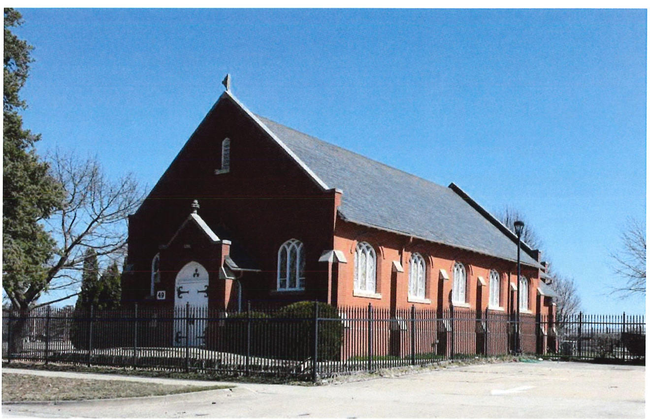
(Chapel exterior)

The footprint of the main block is 36 x 57 feet. The east portion that contains the chancel and vestry measures approximately 18 feet 3 inches by 37 feet 2 inches.