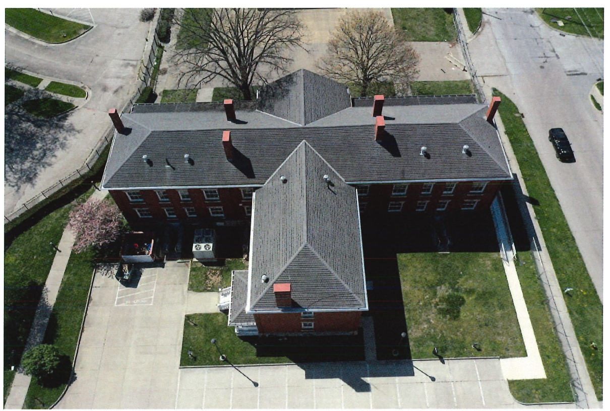
(Clayton Hall aerial view)

The building has a hipped roof, with the peak of the east-west portion rising slightly above the north-south peak. The portico and second story space above it is covered by a gable roof that matches the pitch of the hipped roof portions. The two-story porch across the front is covered with a shed roof. The small porch at the northeast corner also has a hipped roof. All portions of the roof are covered with asphalt shingles. Built-in gutters empty into round downspouts. The soffits are wood with modillions along the underside tucked behind the fascia. A frieze board completes the cornice with returns at the bottom of each gable. Seven brick chimneys penetrate the roof. These are capped as they do not serve any working fireplaces. Mechanical services are vented using simple metal pipes located away from the primary façade so they are not visible from ground level.