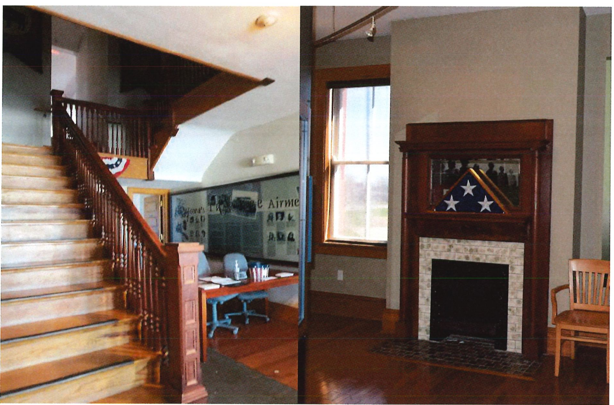
(Interior Clayton Hall, photos by Kelli Lydon)

The first floor east wing contains a kitchen, dining room, a small gallery, and two large multi-stall restrooms. An exterior door in the south wall of the dining room opens onto the porch. Of particular note in the kitchen is a pair of original pocket doors that were retained in the 2002 renovation. They were once the doors between an apartment's parlor and bedroom and now they separate the main kitchen from its storage area. The gallery and dining room feature two of the building's original fireplaces. These are back-to-back on either side of the wall, a design that is mirrored on the west side of the building. The original hearth tile and surround tile are intact on the gallery fireplace while only the hearth tile is original on the dining room fireplace. The wood mantles and surrounds are sensitive replacements. None of the fireplaces in the building are functional, but they are preserved in their original locations.