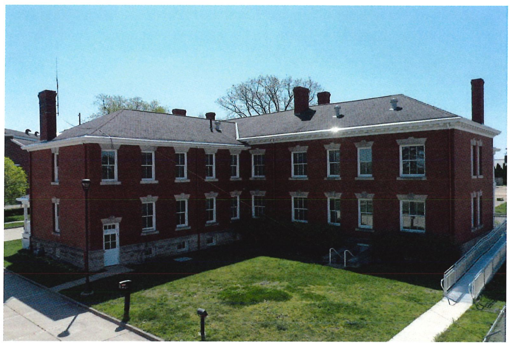
(View of Clayton Hall from the northwest)

All of the venting windows on this building are double hung wood windows replicated from original designs. On the south façade, fifteen three-over-three windows are equally spaced across the two main levels, with one of these windows at the center of the entry portico. This window is flanked by a pair of two-over-two windows and a half-round window with three lights is centered in the south-facing gable. At each end of the east and west wings, a pair of two-over-two windows are placed closed together, centered on the wall at both levels. The end of the north wing has only one of these two-over-two windows on each level. All of the windows in the north wing are two-over-two windows. This includes nine on the east wall and nine on the west wall. The north wall of each of the east and west wings has a combination of four two-over-two and six three-over-three windows.