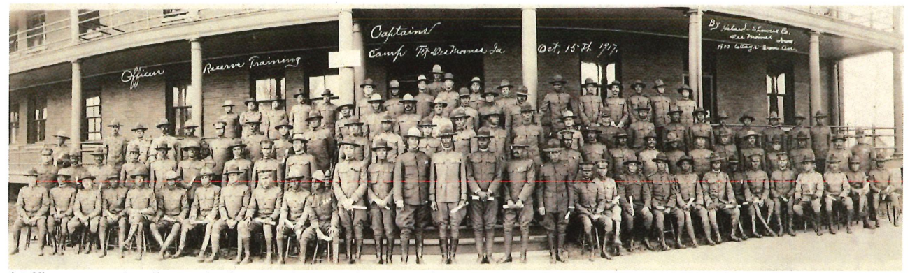
(Officers graduation)

The success of the Seventeenth Provisional Training Regiment and the Medical Officers Training Camp was an important step forward in the push toward a fully integrated U. S. military.