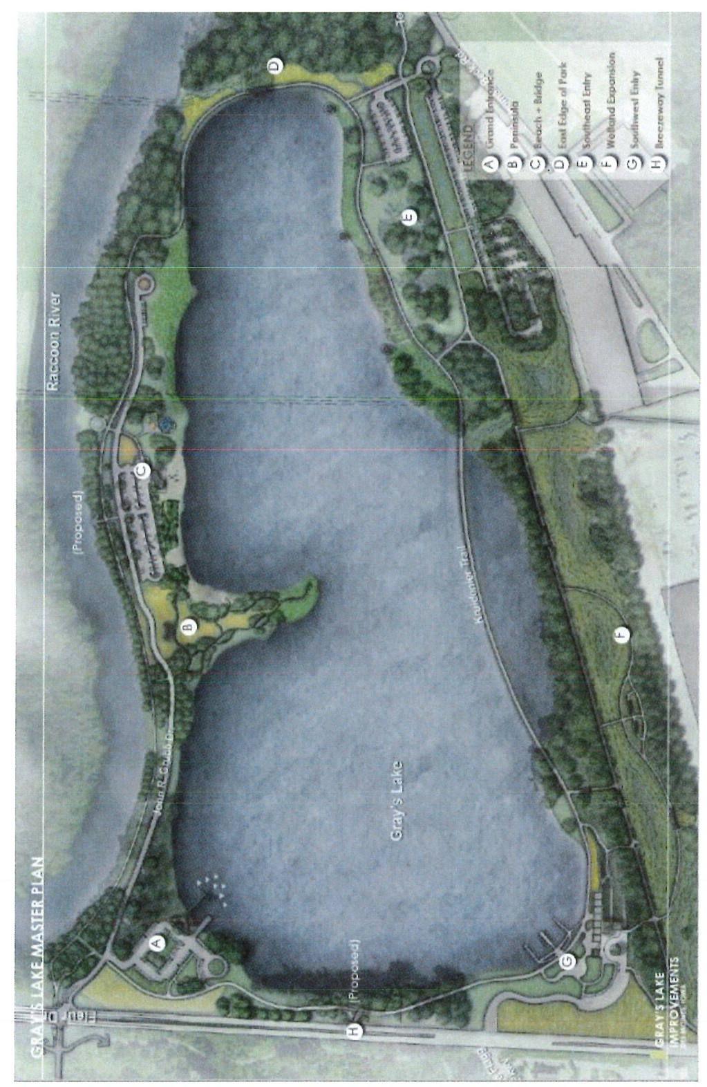
2016 Gray's Lake Park Master Plan – Areas A through G including Area F as expanded parkland

RECEIVE AND FILE COMMUNICATION FROM THE PARKS AND RECREATION BOARD REGARDING APPROVAL OF THE SW INFRASTRUCTURE AND PLANNING STUDY AND RECOMMENDATION OF DEDICATION OF GRAY'S LAKE WETLANDS PROJECT AREA AS PARKLAND