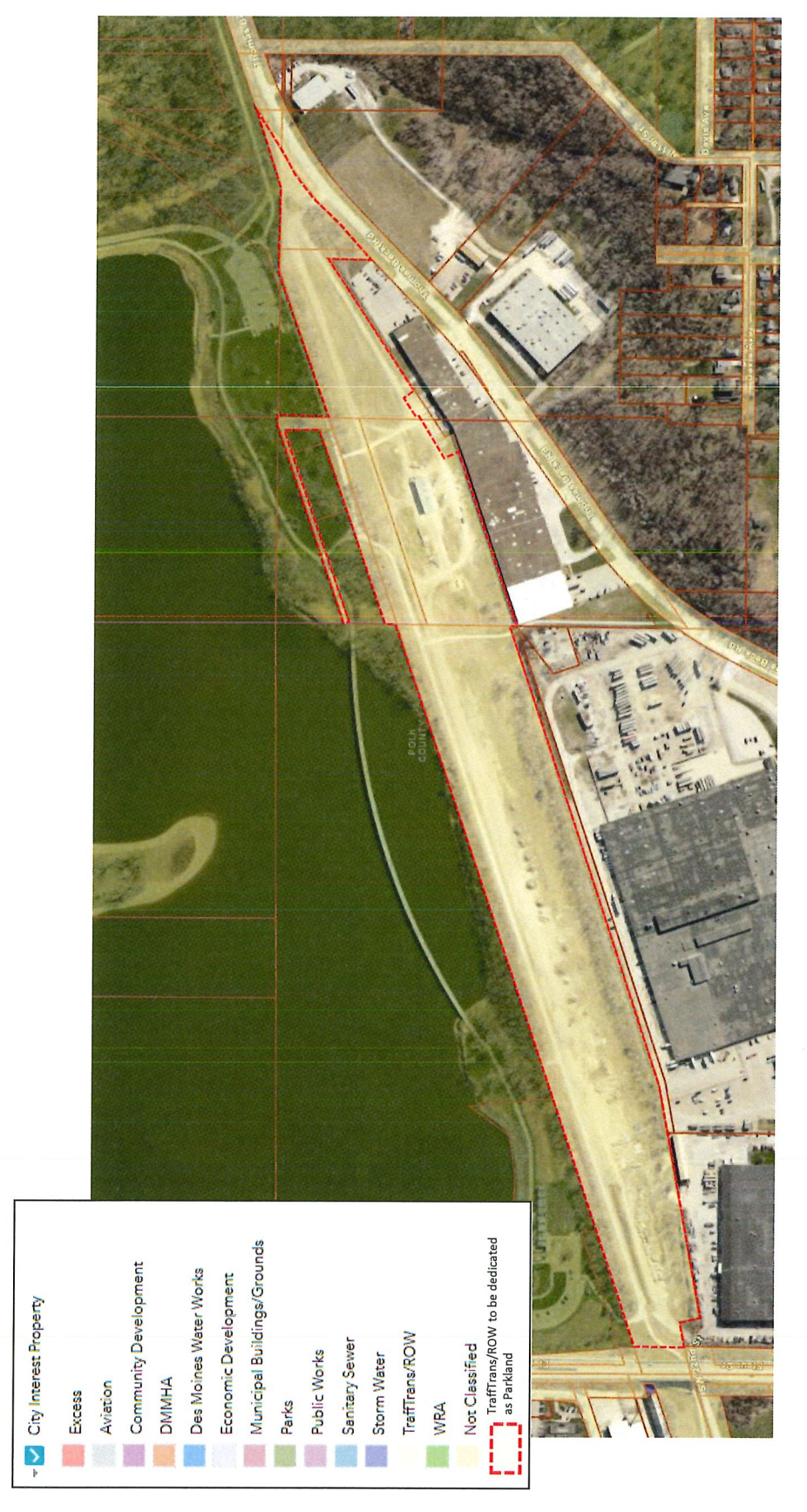
City Interest Properties and Parcels as shown in Des Moines Maps

RECEIVE AND FILE COMMUNICATION FROM THE PARKS AND RECREATION BOARD REGARDING APPROVAL OF THE SW INFRASTRUCTURE AND PLANNING STUDY AND RECOMMENDATION OF DEDICATION OF GRAY'S LAKE WETLANDS PROJECT AREA AS PARKLAND