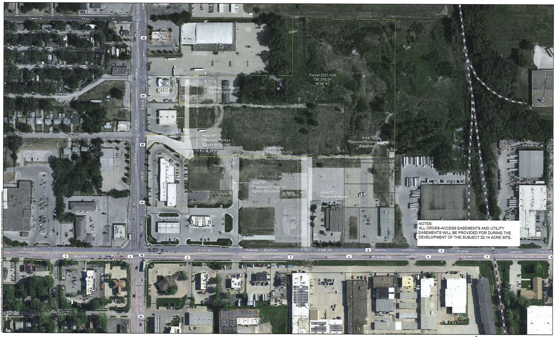
Eastgate Large-Scale Development Plan- Grand View University Access Easements

DES MOINES, IOWA | Date: February 23, 2022