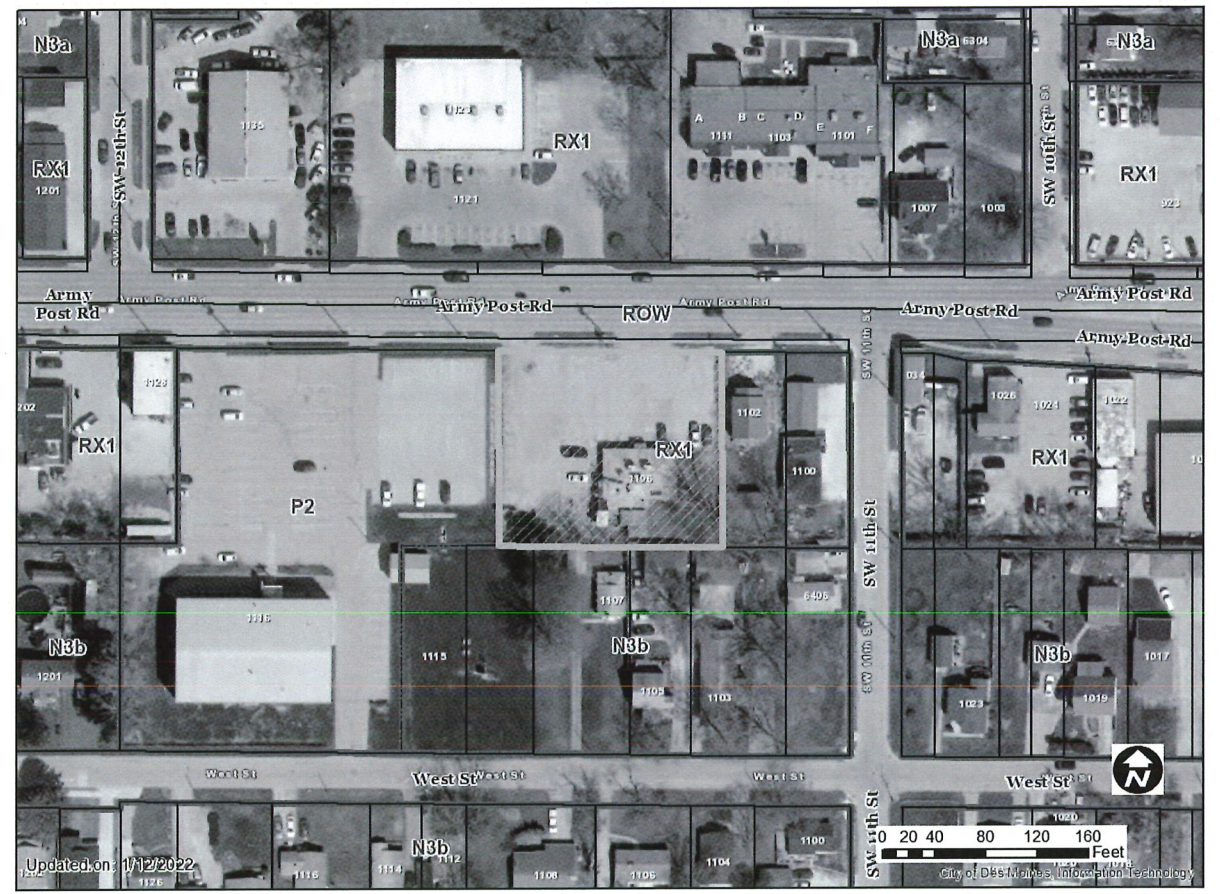
1 inch = 93 feet