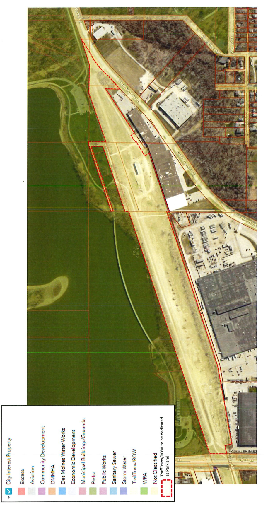
City Interest Properties and Parcels as shown in Des Moines Maps

RECEIVE AND FILE COMMUNICATION FROM THE PARKS AND RECREATION BOARD REGARDING APPROVAL OF THE SW INFRASTRUCTURE AND PLANNING STUDY AND RECOMMENDATION OF DEDICATION OF GRAY'S LAKE WETLANDS PROJECT AREA AS PARKLAND