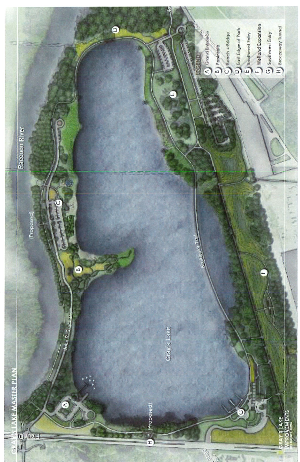
2016 Gray's Lake Park Master Plan - Areas A through G including Area F as expanded parkland

RECEIVE AND FILE COMMUNICATION FROM THE PARKS AND RECREATION BOARD REGARDING APPROVAL OF THE SW INFRASTRUCTURE AND PLANNING STUDY AND RECOMMENDATION OF DEDICATION OF GRAY'S LAKE WETLANDS PROJECT AREA AS PARKLAND