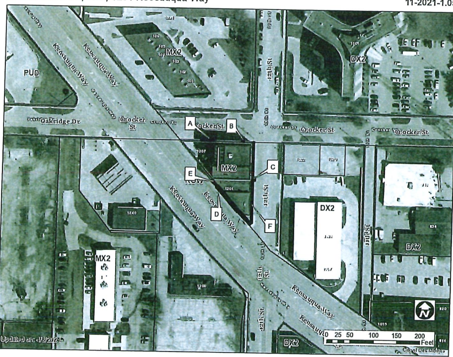
1 inch = 98 feet