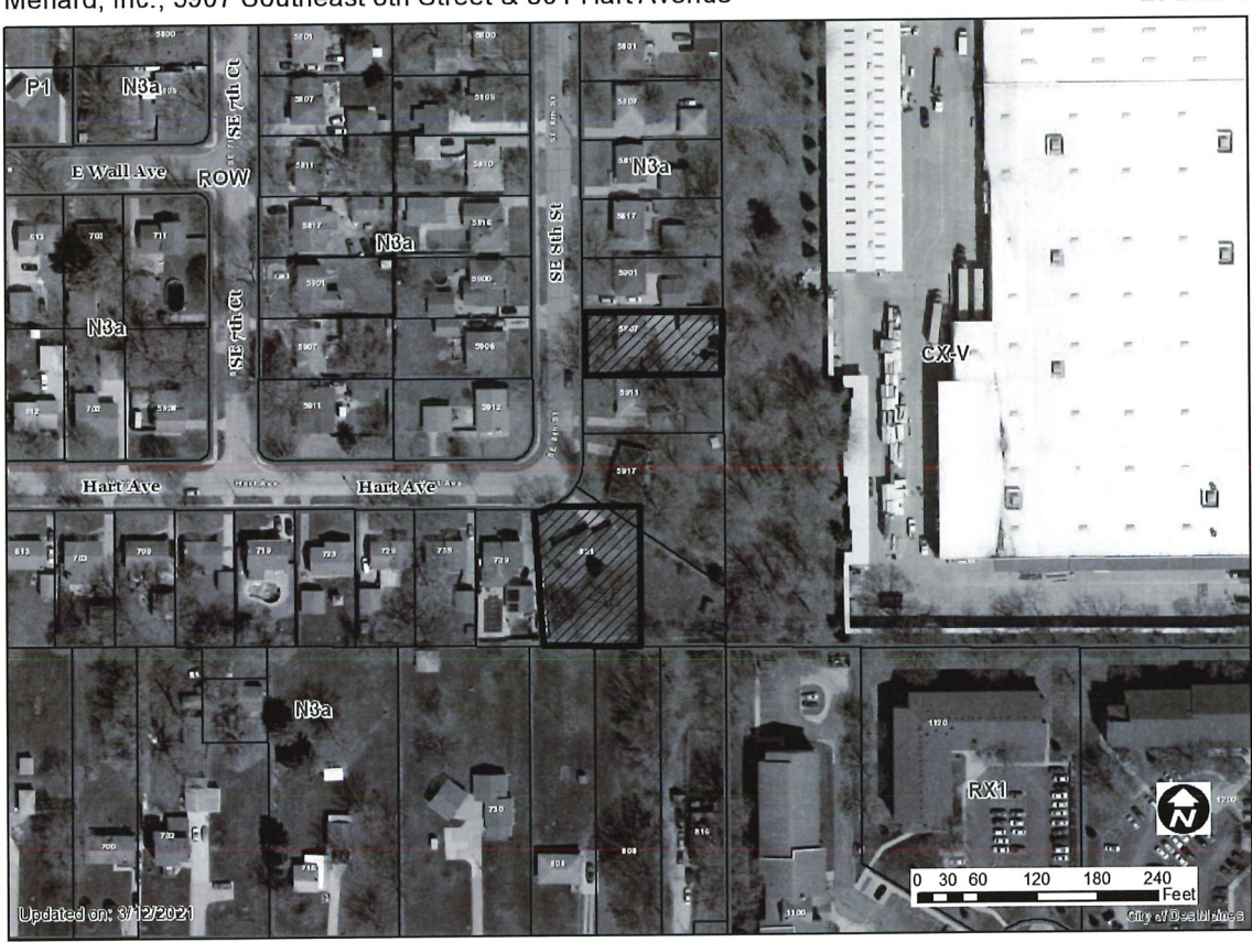
1 inch = 124 feet