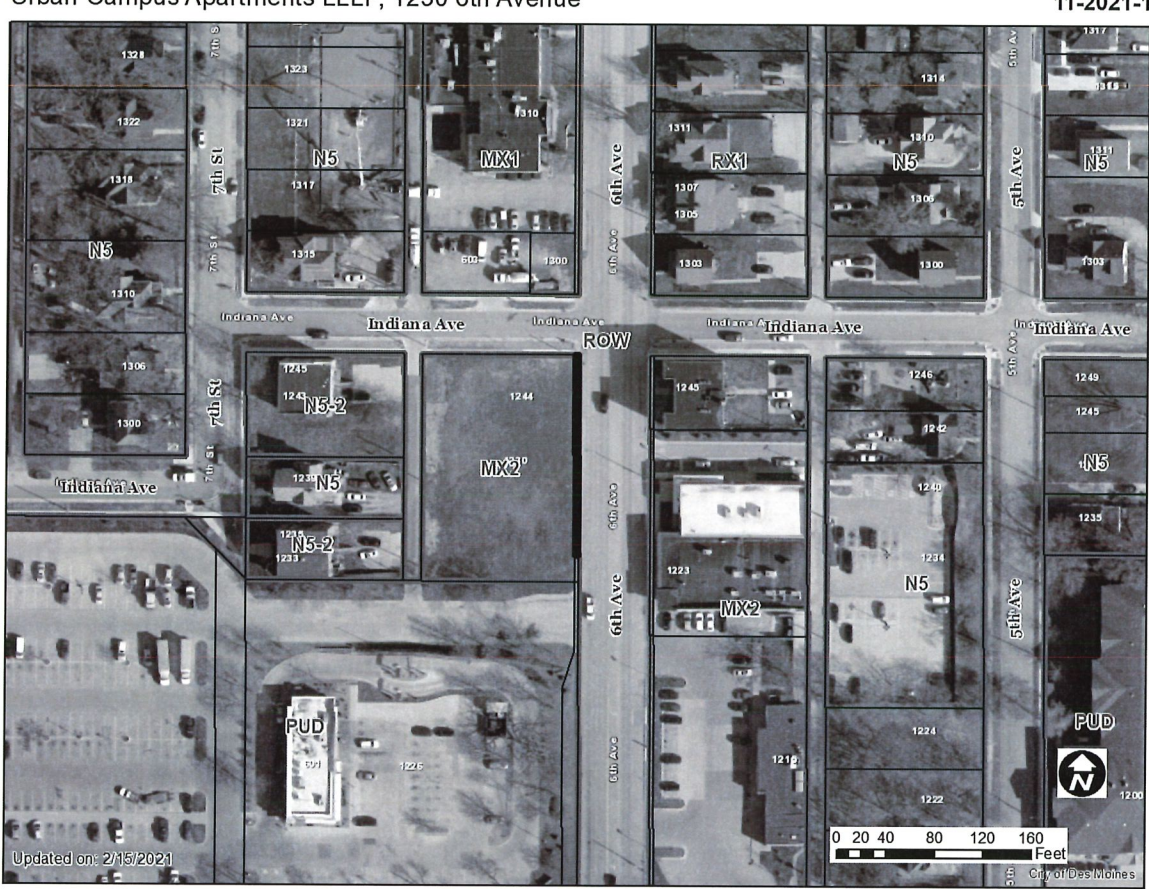
1 inch = 94 feet