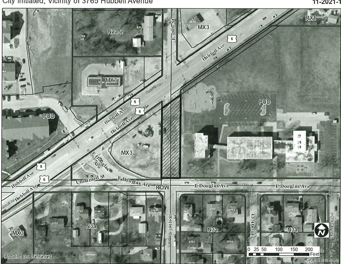
1 inch = 113 feet