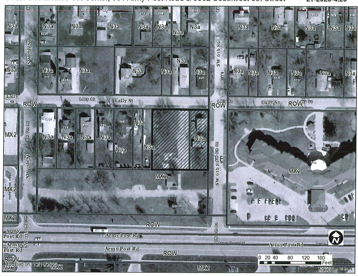
1 inch = 93 feet