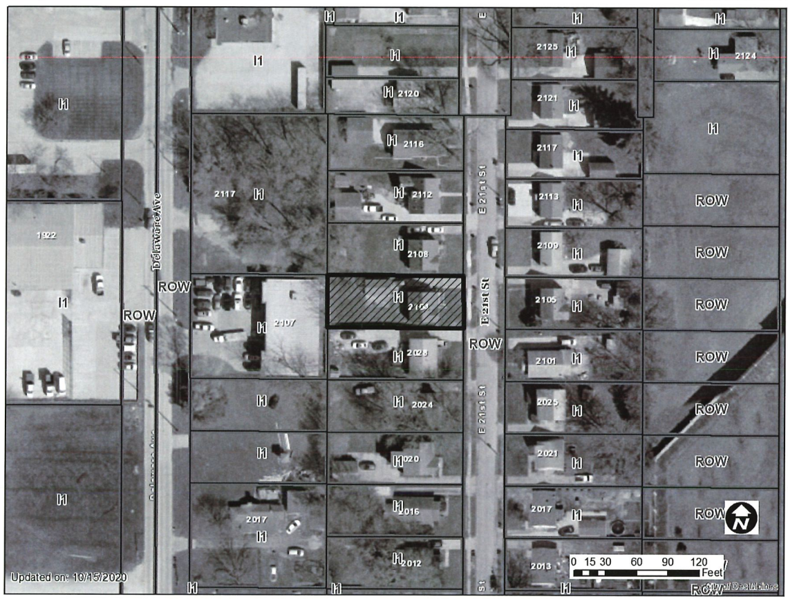
1 inch = 75 feet