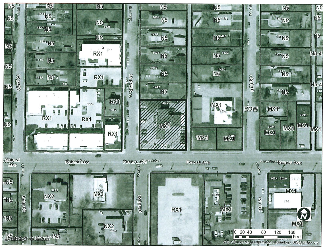
1 inch = 90 feet