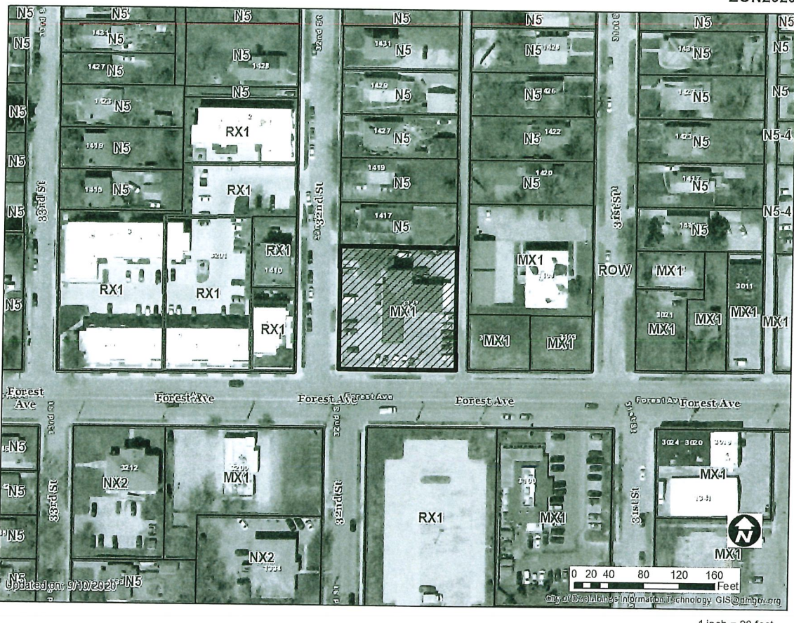
1 inch = 90 feet