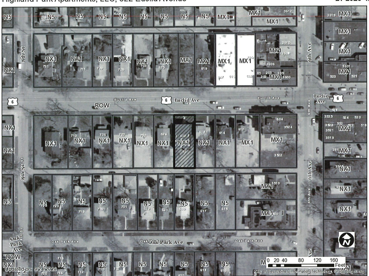
1 inch = 89 feet