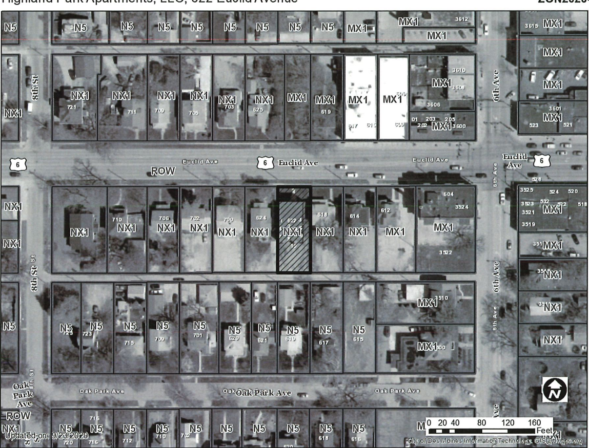
1 inch = 89 feet