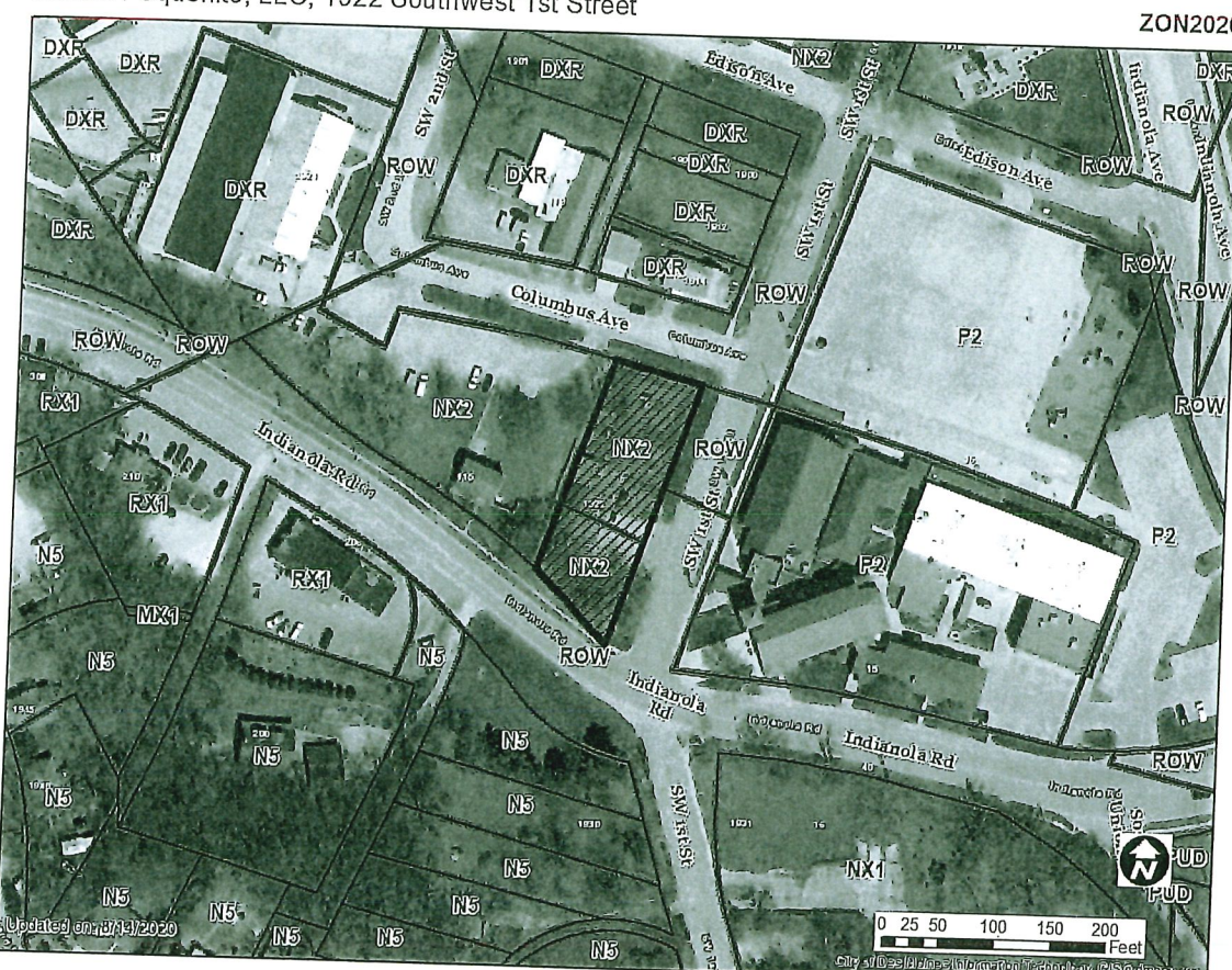
1 inch = 108 feet