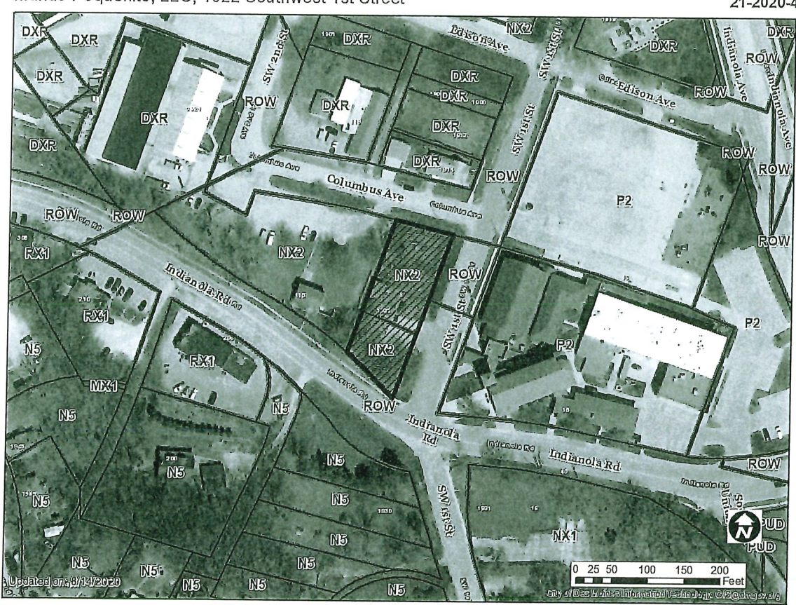
1 inch = 108 feet