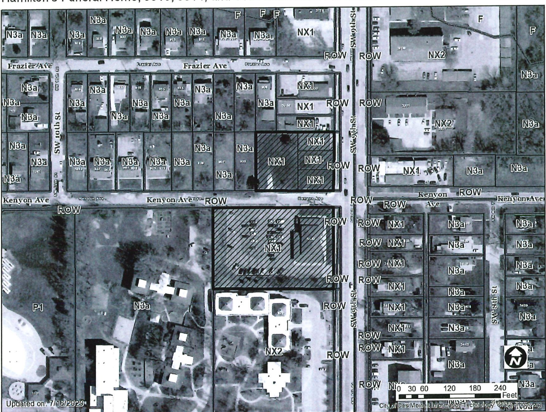
1 inch = 129 feet