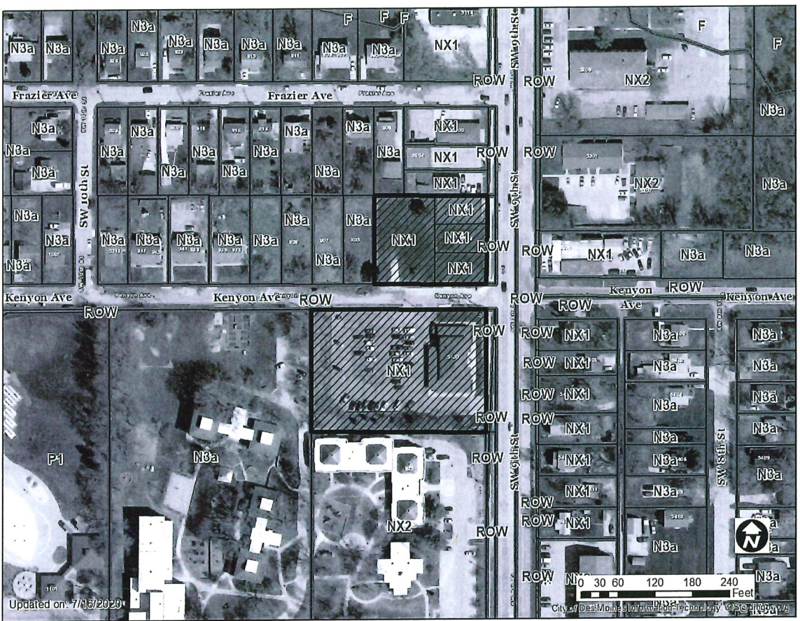
1 inch = 129 feet