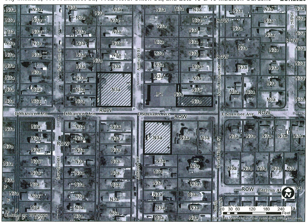
1 inch = 125 feet