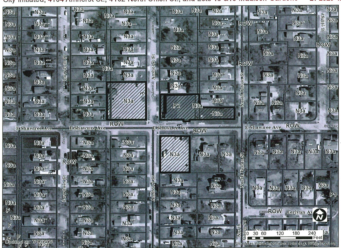
1 inch = 125 feet