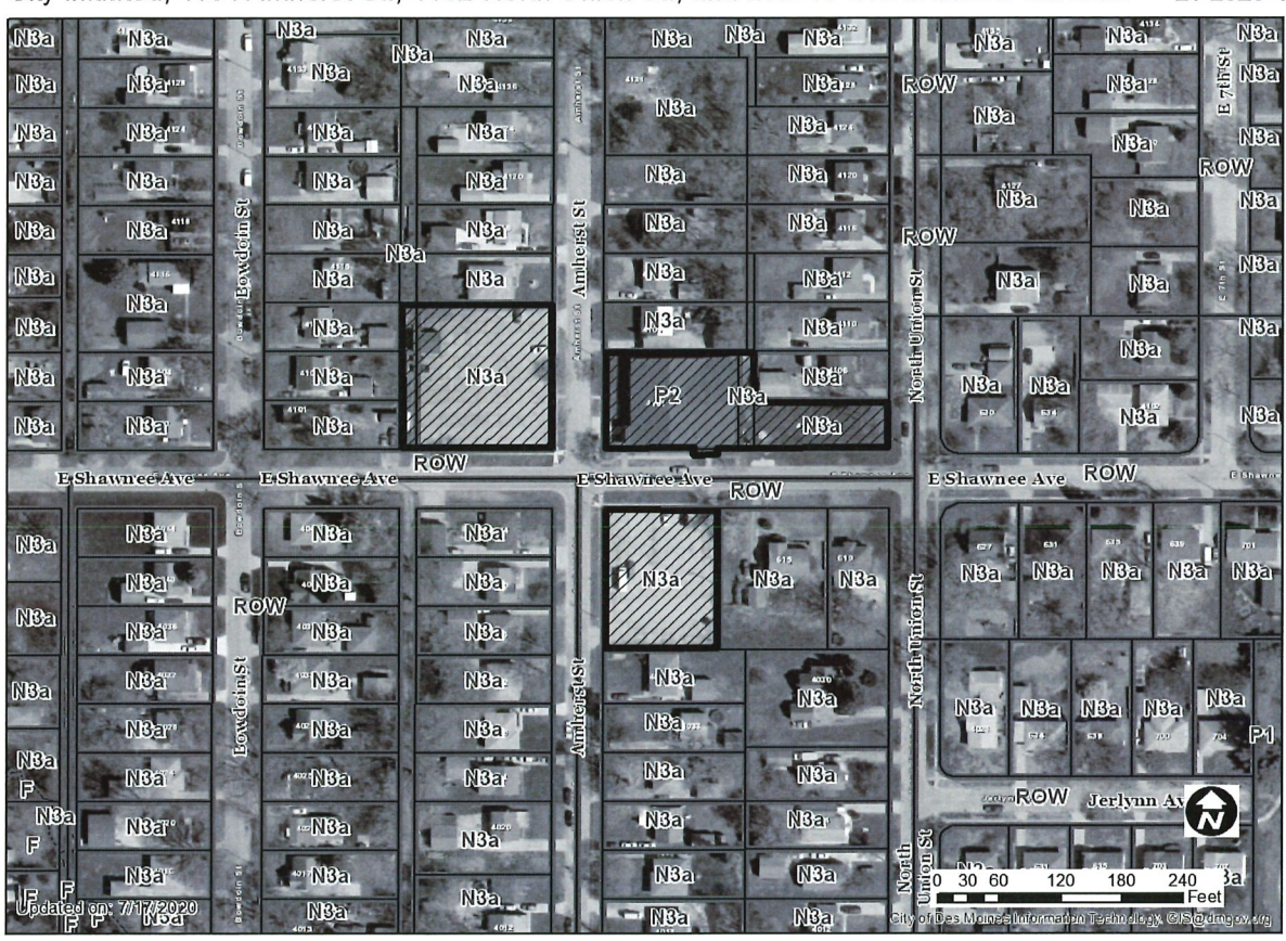
1 inch = 125 feet