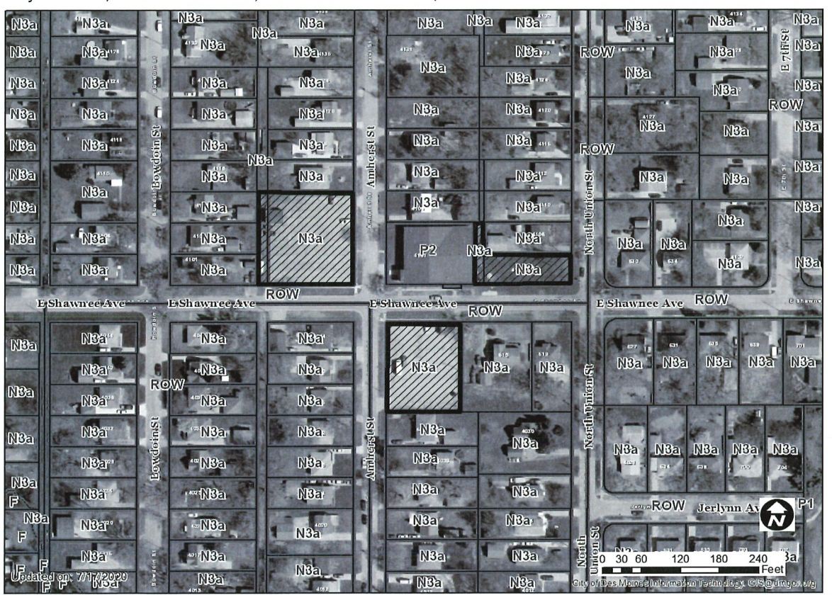
1 inch = 125 feet

City initiated, 4104 Amherst St., 4102 North Union St., and Lots 18 & 19 Madison Gardens ZON2020-00083