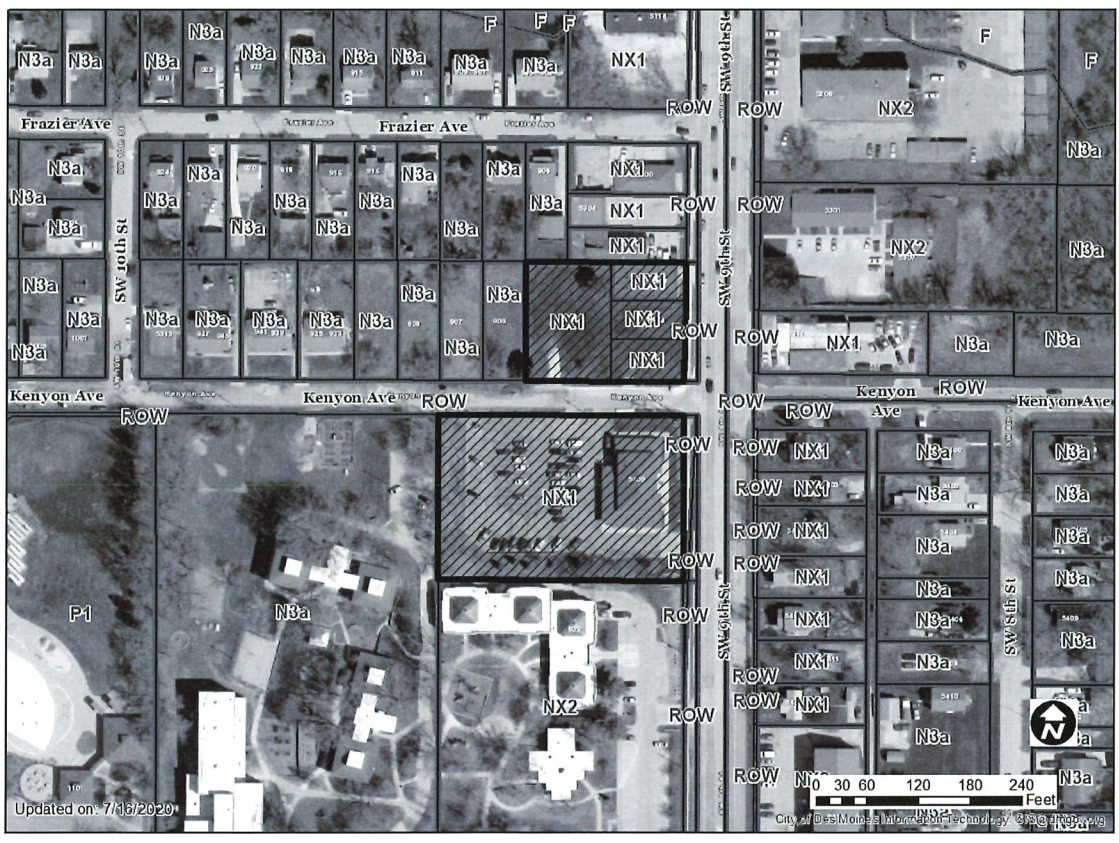
1 inch = 129 feet