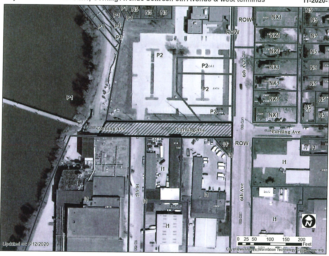
1 inch = 103 feet