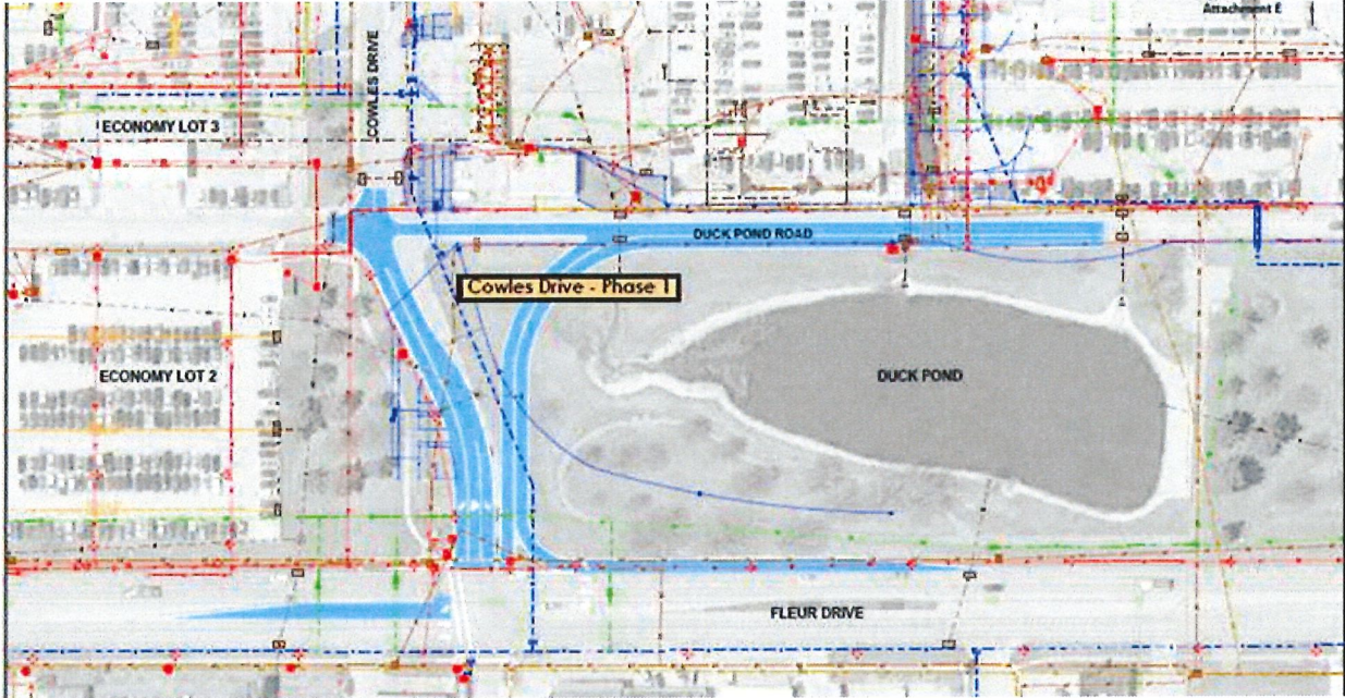
Project Site Map: