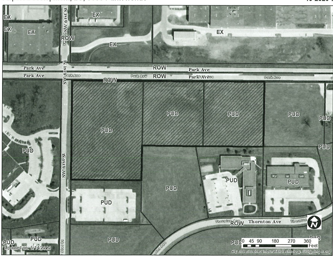
1 inch = 185 feet