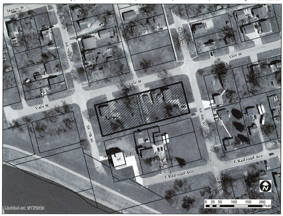
1 inch = 98 feet

Anchor Investment Group, LLC, 901 S.E. 7th St., 709 Vale St., 714 Vale St., vacated alley ZON2020-00025