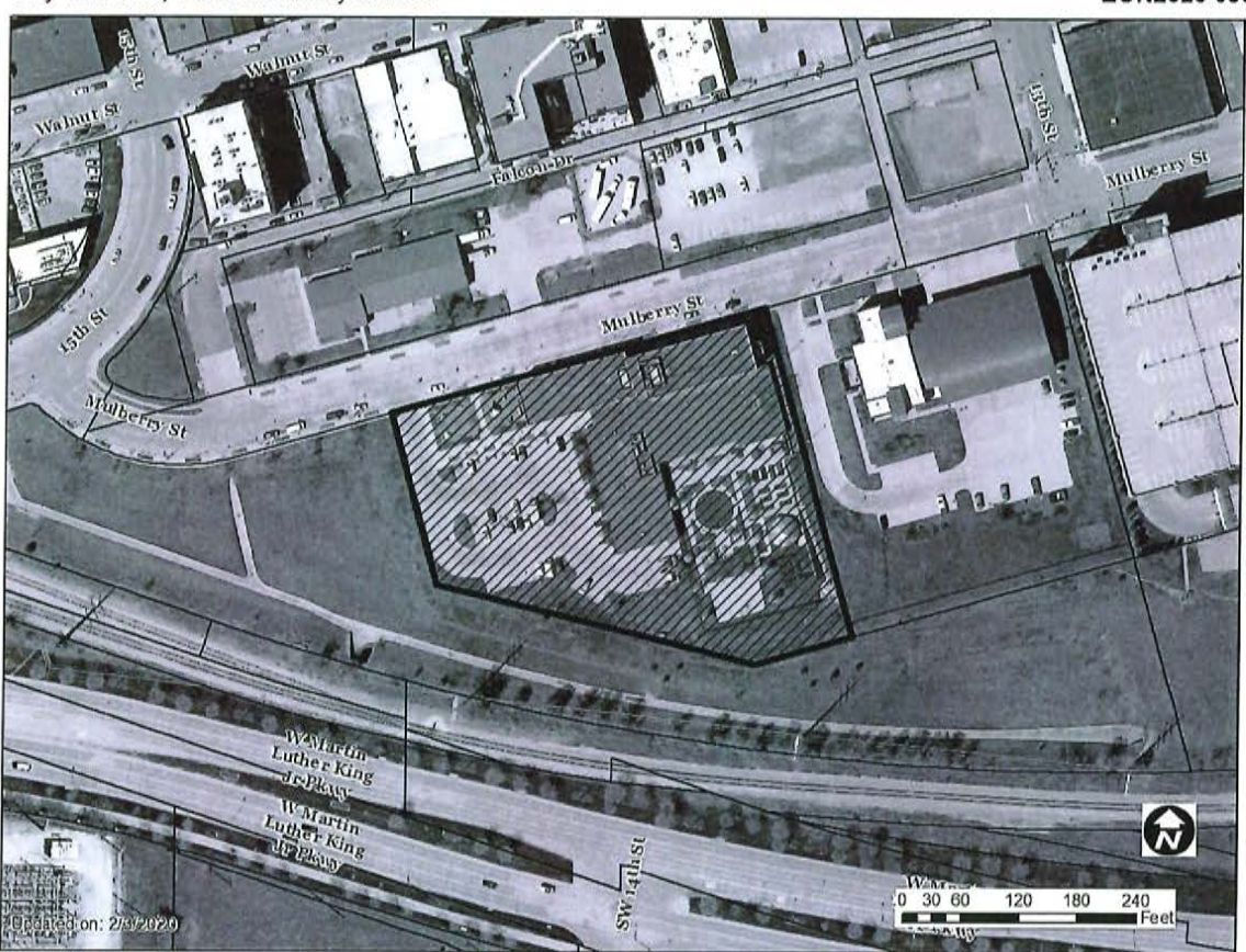
1 inch = 128 feet