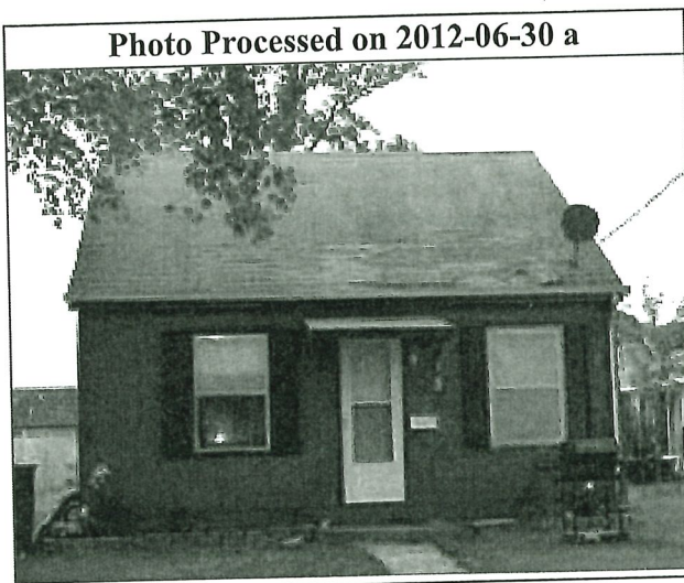
Photo Processed on 2012-06-30 a

Bigger Map Polk County GIS Google Map Pictometry