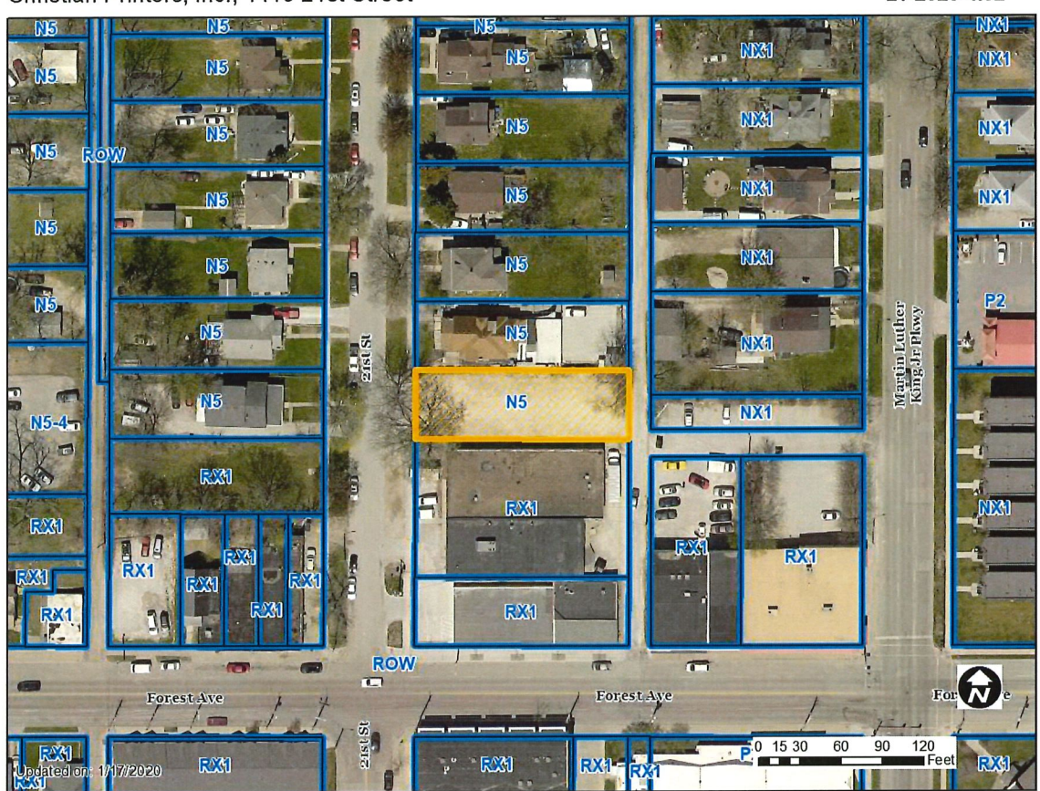
1 inch = 75 feet