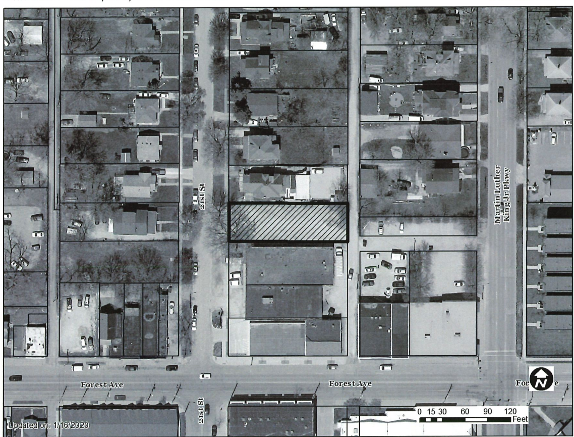
1 inch = 75 feet