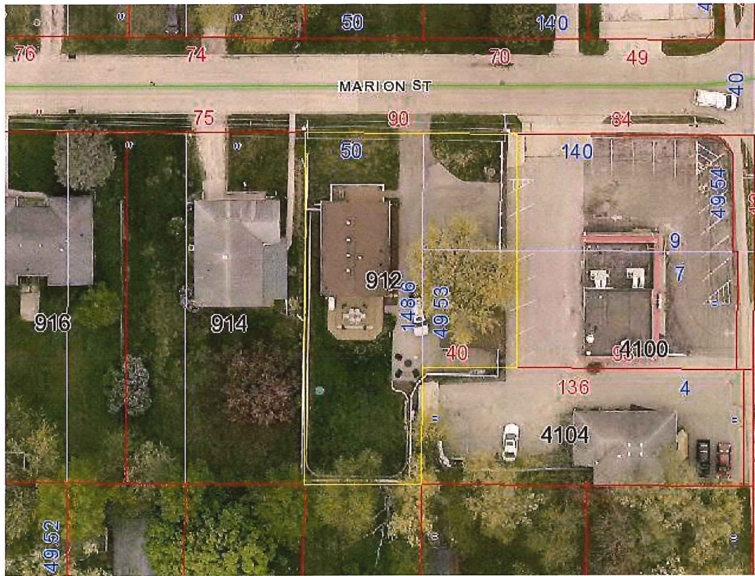
320' x 240' -- Click to center and select a parcel