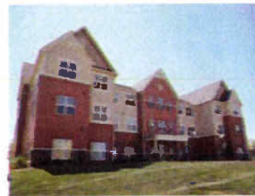
Approximate date of photo 04-21-2012

The following is the site location for which CKHS intends to develop a site plan for another senior housing project, across the street at 5602 SW 9 th ( http://goo.gl/Yn0a1Y ):