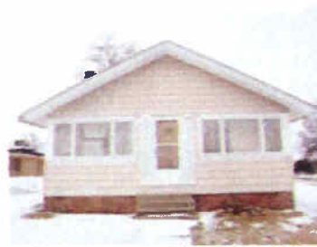
Approximate date of photo 05-05-2008