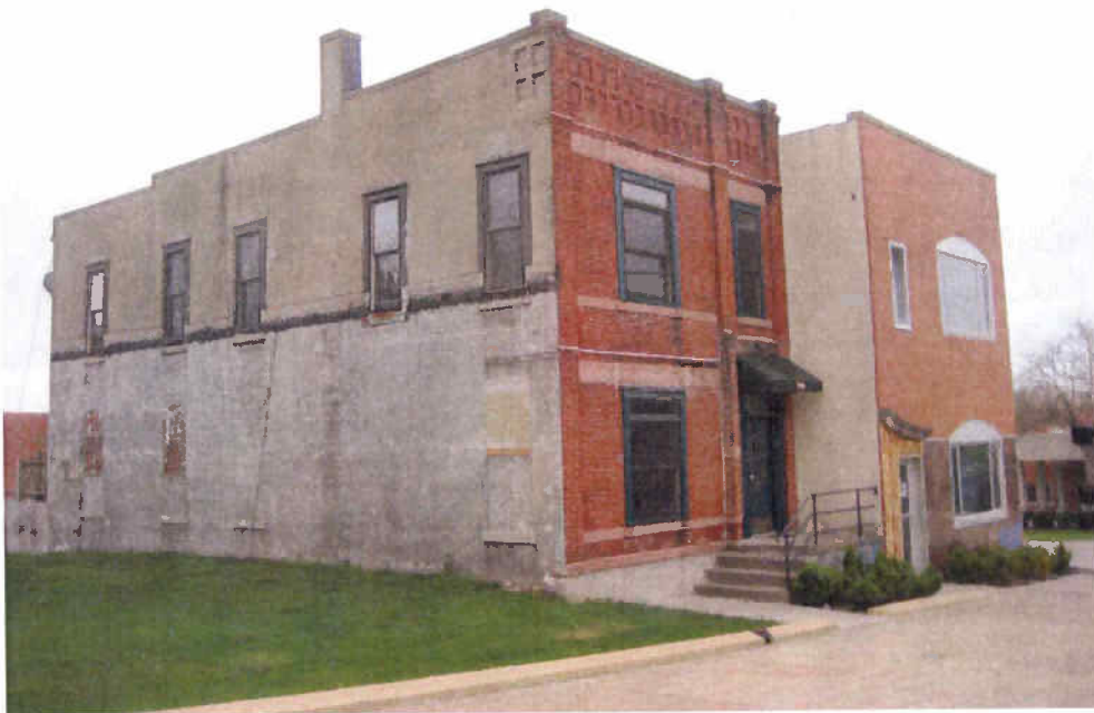
Photo 2: Samuel Green Rowhouse–Norden Hall, 709 E. Locust Street, north façade and east elevation. Photo taken from Capitol Grounds / West Capitol Terrace looking southwest. (May 30, 2013)