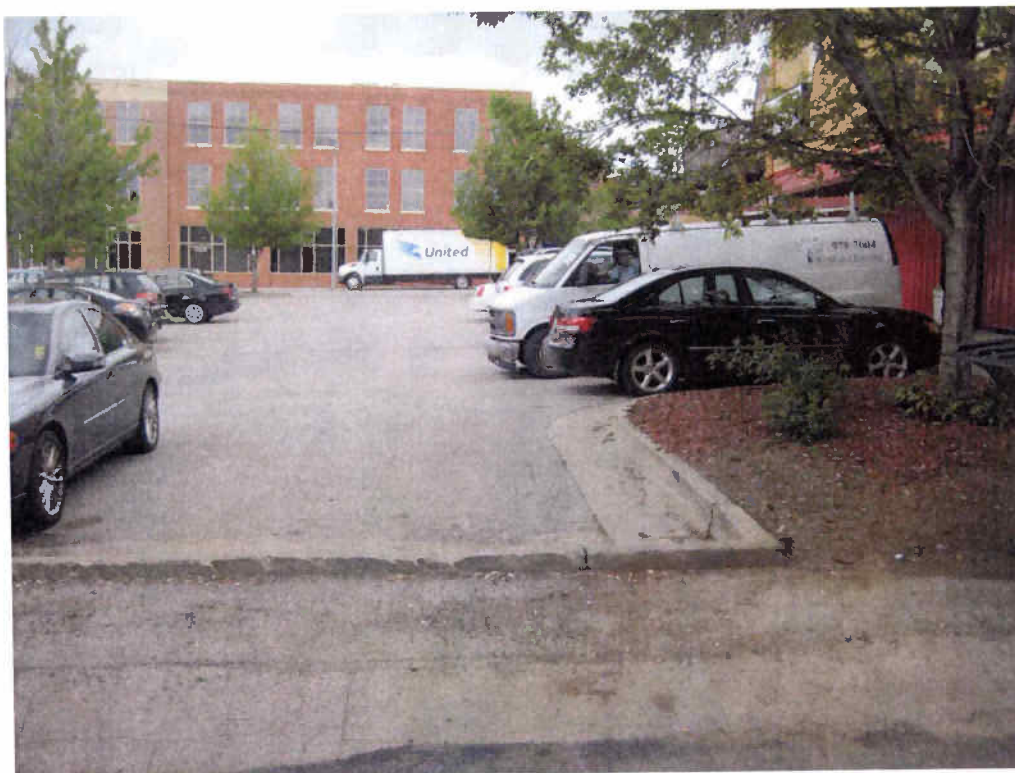
Photo 6: Proposed move site, 425 E. Grand Avenue. Photo taken from alley looking north across lot toward East Grand Avenue. (May 30, 2013)