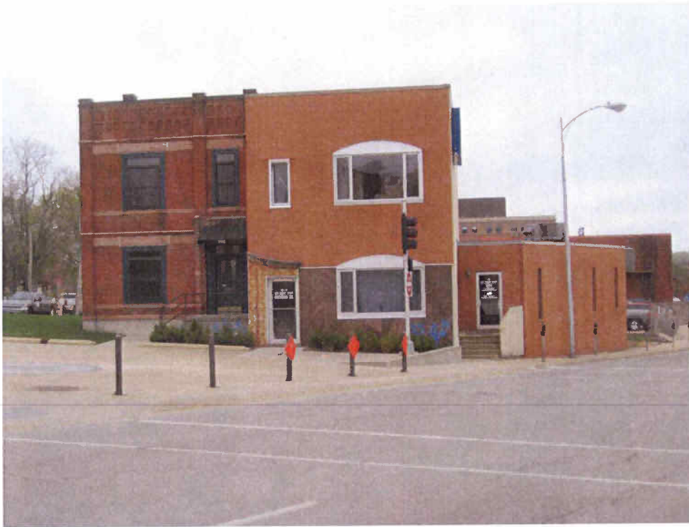
Photo 1: Samuel Green Rowhouse–Norden Hall, 709 E. Locust Street, pictured on left. To the right is 707 E. Locust Street. Photo taken from Pennsylvania Avenue looking southeast. (May 30, 2013)