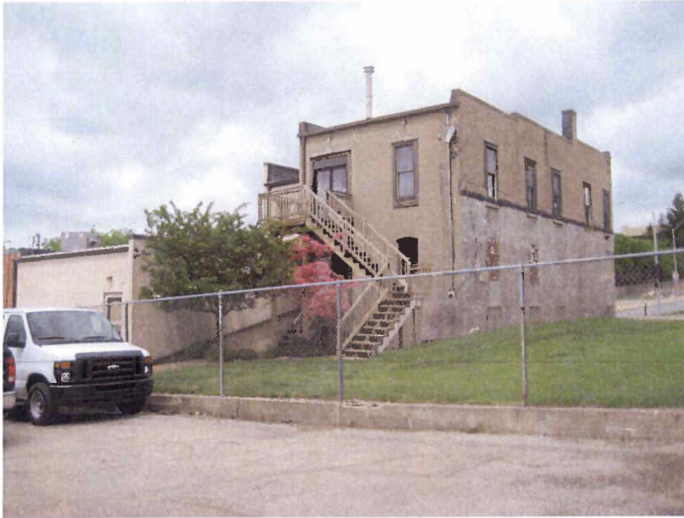
Photo 3: Samuel Green Rowhouse–Norden Hall, east and south elevations. Photo taken from East Seventh Street state parking lot looking northwest. (May 30, 2013)