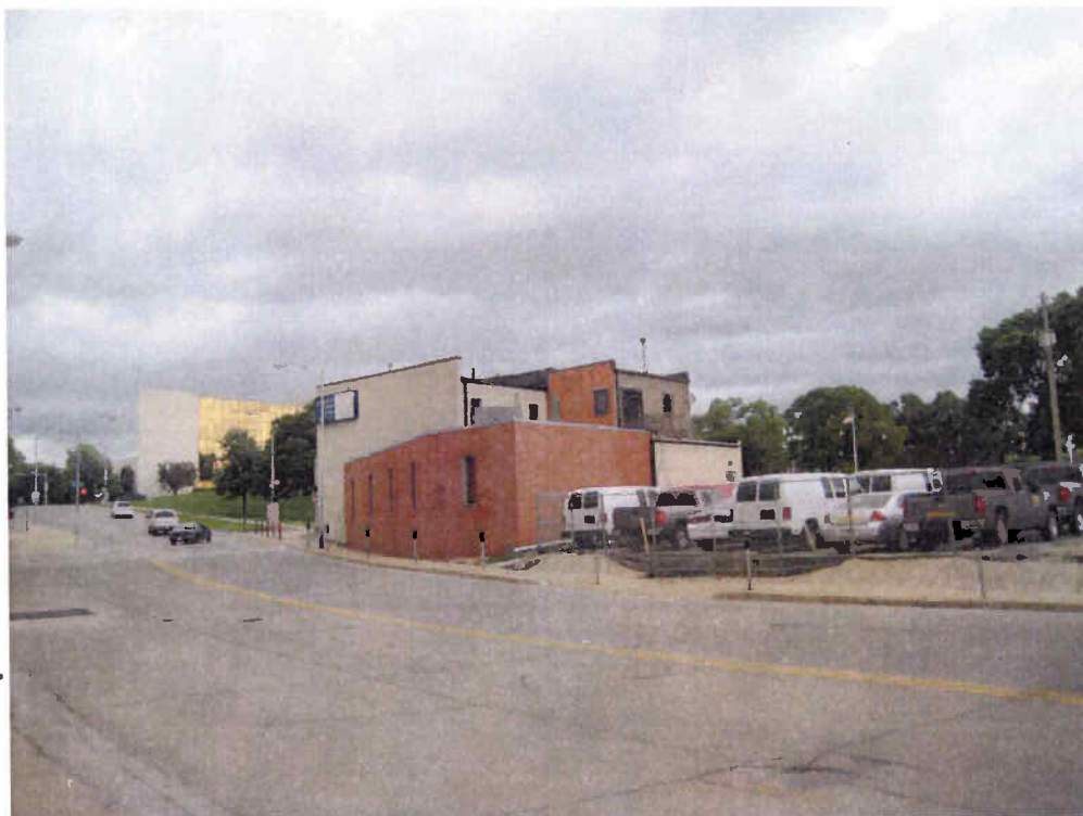
Photo 4: Samuel Green Rowhouse–Norden Hall, west and south elevations. Photo taken from East Seventh Street looking northeast. (May 30, 2013)