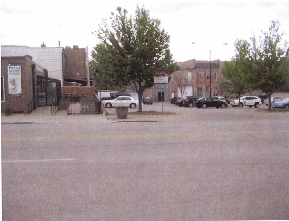
Photo 5: Proposed move site, 425 E. Grand Avenue. Currently a city-owned parking lot. Photo taken from East Grand Avenue looking south across lot. (May 30, 2013)