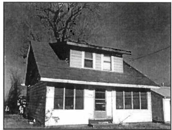
Approximate date of photo 12/17/2004