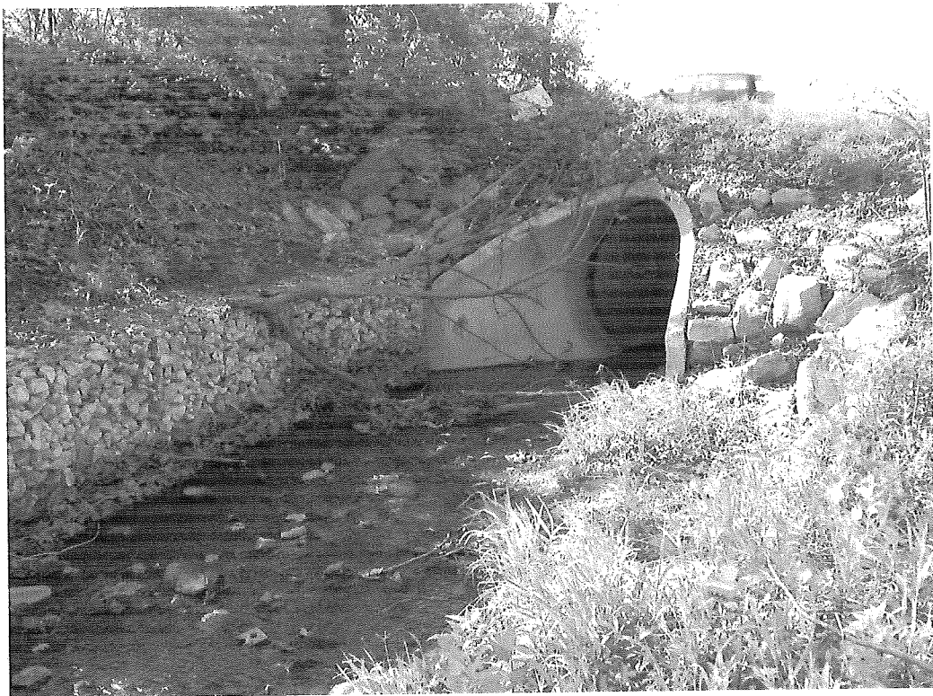
Creek running into the entrance to calvert to Gray's Lake under Bell Ave