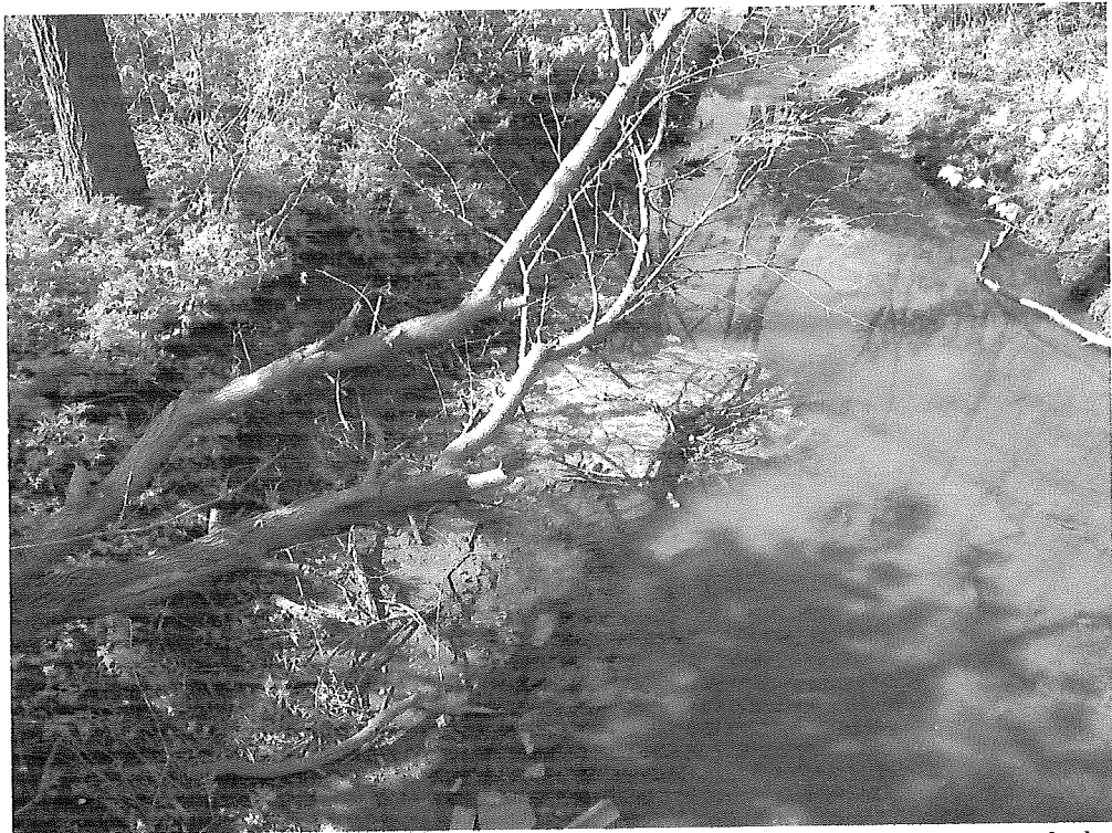
Creek Photo from First Unitarian Church (facing north )