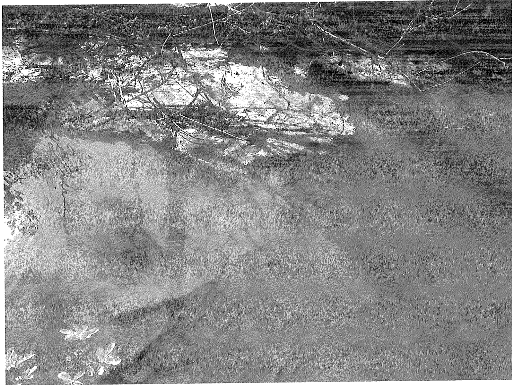
Close Up Photo of the Algae in Creek (before Creek enters calvert)