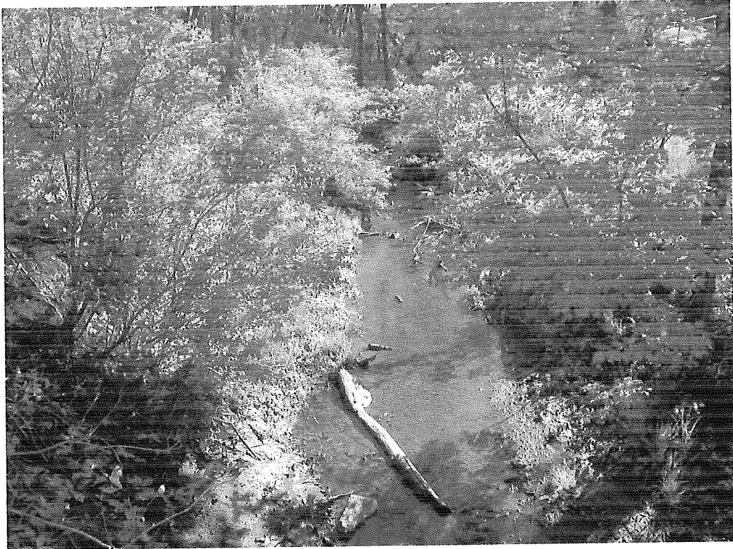
Creek Photo from First Unitarian Church ( facing south )