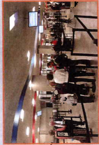
Passenger Screening Area Expansion

Runway 13-31 Overlay – The entire length of the Airport's main runway was resurfaced, removing three inches of existing surface and replacing it with a seven-inch overlay. A new runway lighting system was also installed, and new paved shoulders provide improved drainage and more room for maintenance. Completion of this allows the Airport to fully implement its Preferential Runway Usage Plan. This plan allows air traffic controllers to route traffic to any runway configuration/sequence that facilitates airspace efficiency and minimizes noise exposure to area residents and businesses.