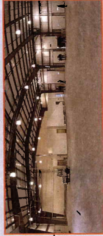
South Cargo Building