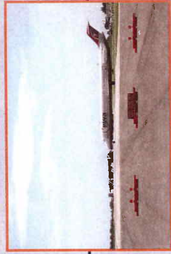
Runway 13-31 Overlay