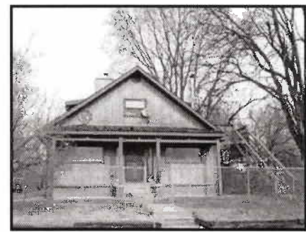
Approximate date of photo 11/24/2004