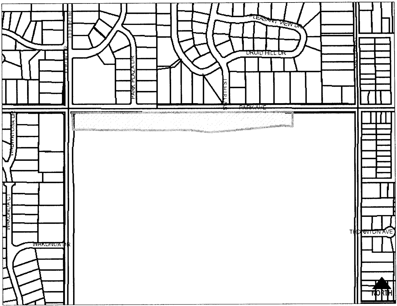
Hubbell Realty Company (Wakonda Townhomes) - 3915 Fleur Drive ZON2007-00202