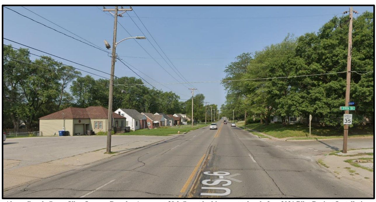
Above Google Street View Image: Douglas Avenue at 39th Street looking west taken before 2021 Pilot Project Installation