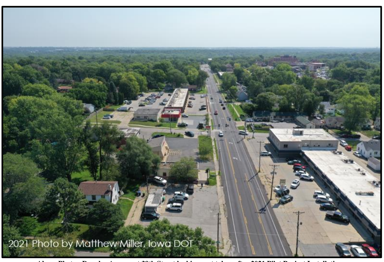
Above Photo: Douglas Avenue at 39th Street looking east taken after 2021 Pilot Project Installation