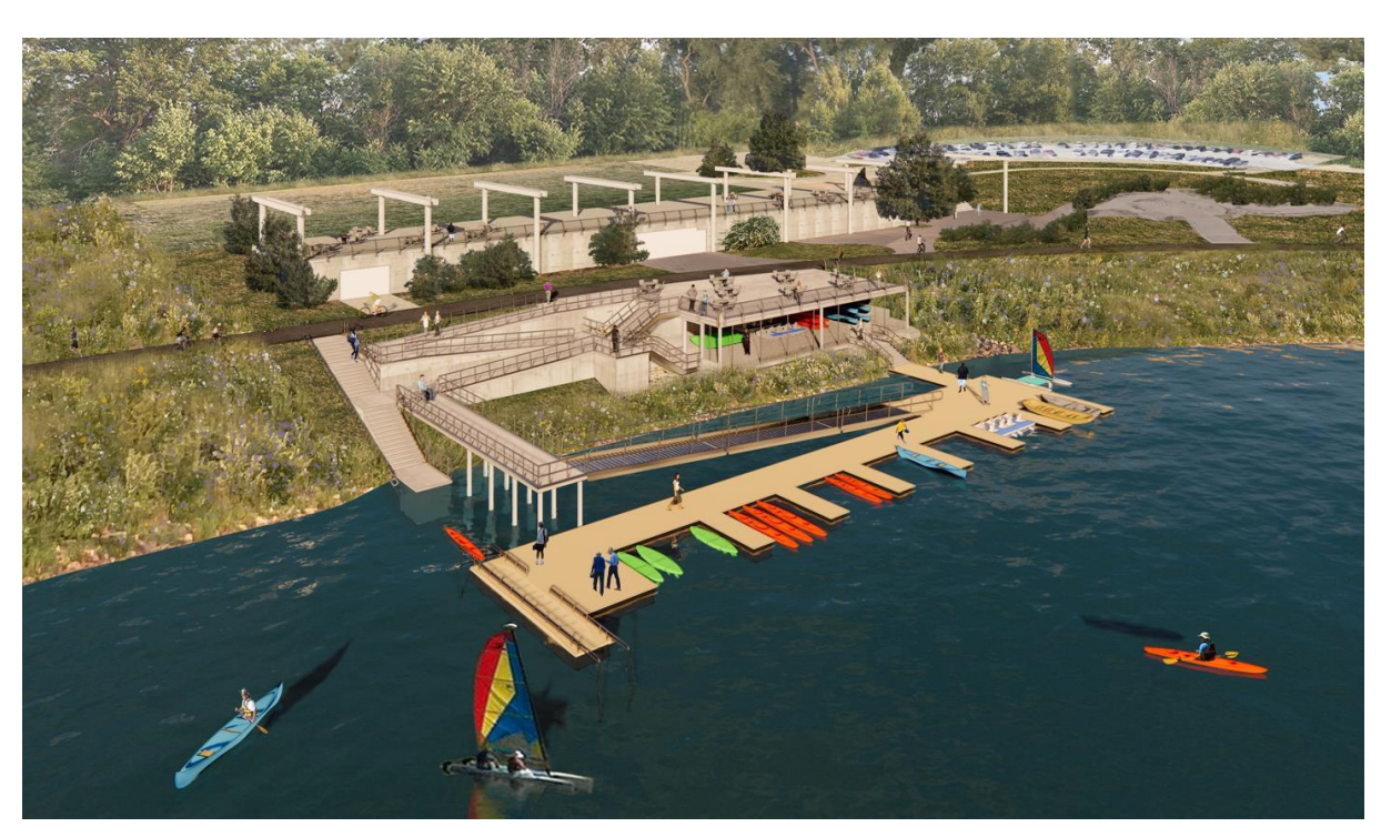
Rendering of Proposed Paddlecraft Marina Development