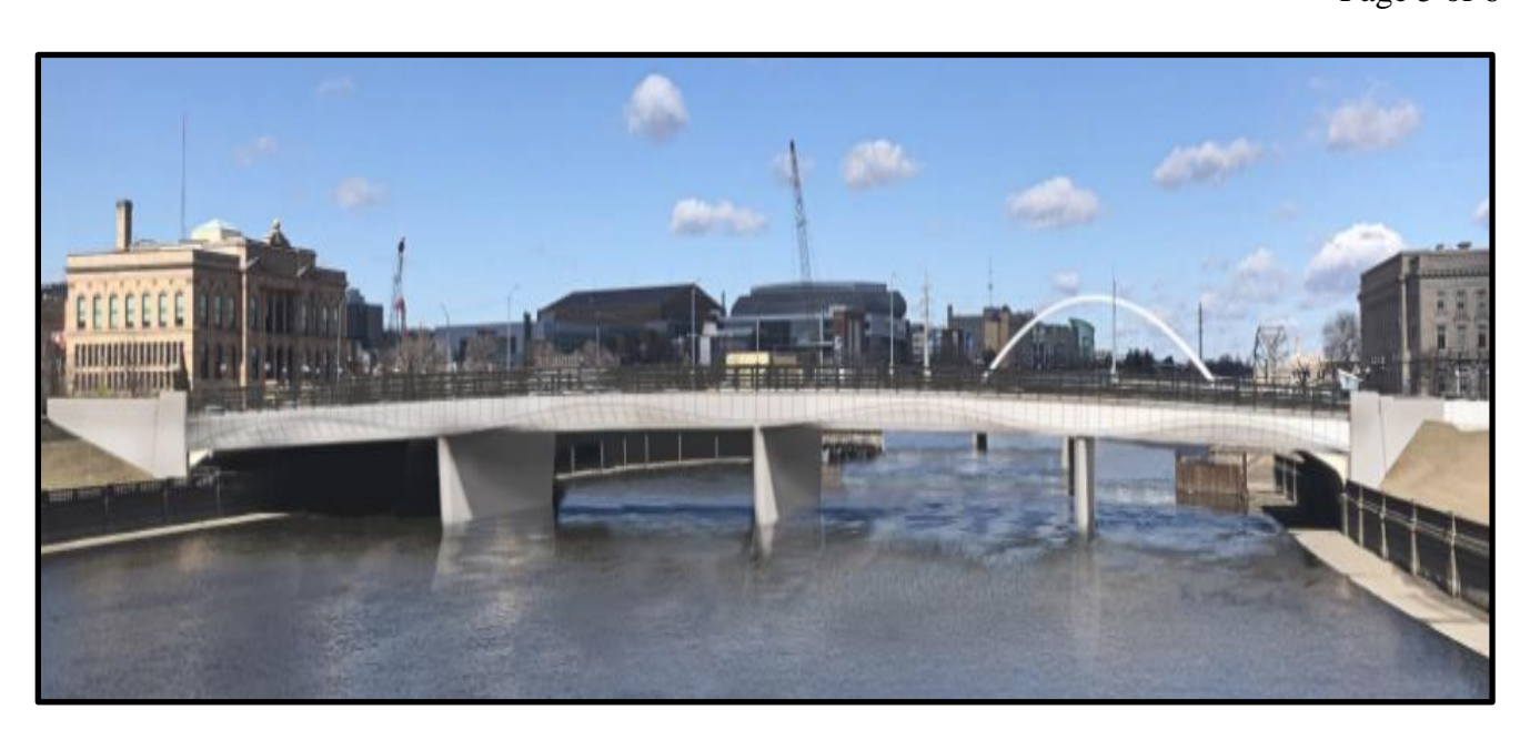
Above Image: Rendering of Walnut Street Bridge Replacement Design