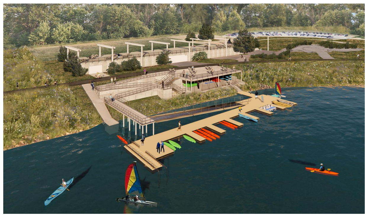
3D Model Rendering of Proposed Paddlecraft Marina Development