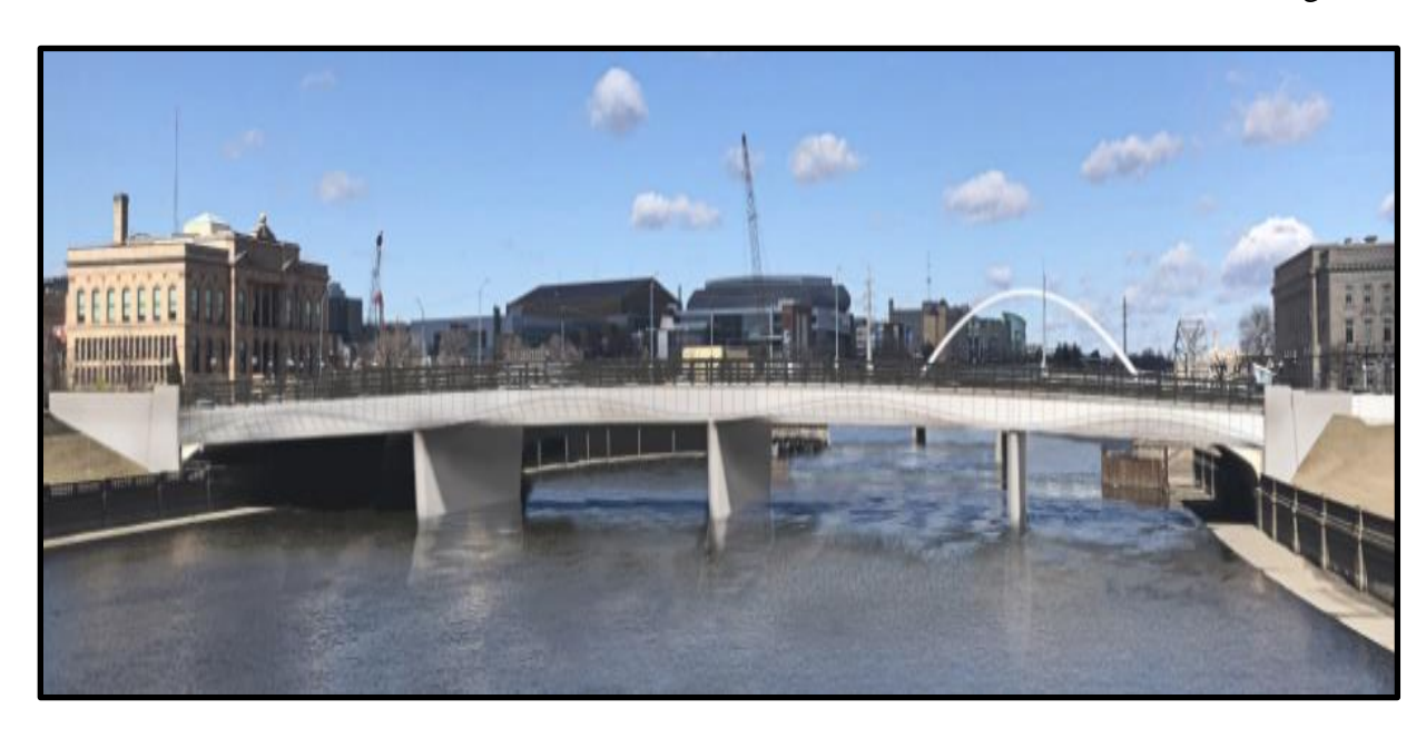
Above Image: Rendering of Walnut Street Bridge Replacement Design