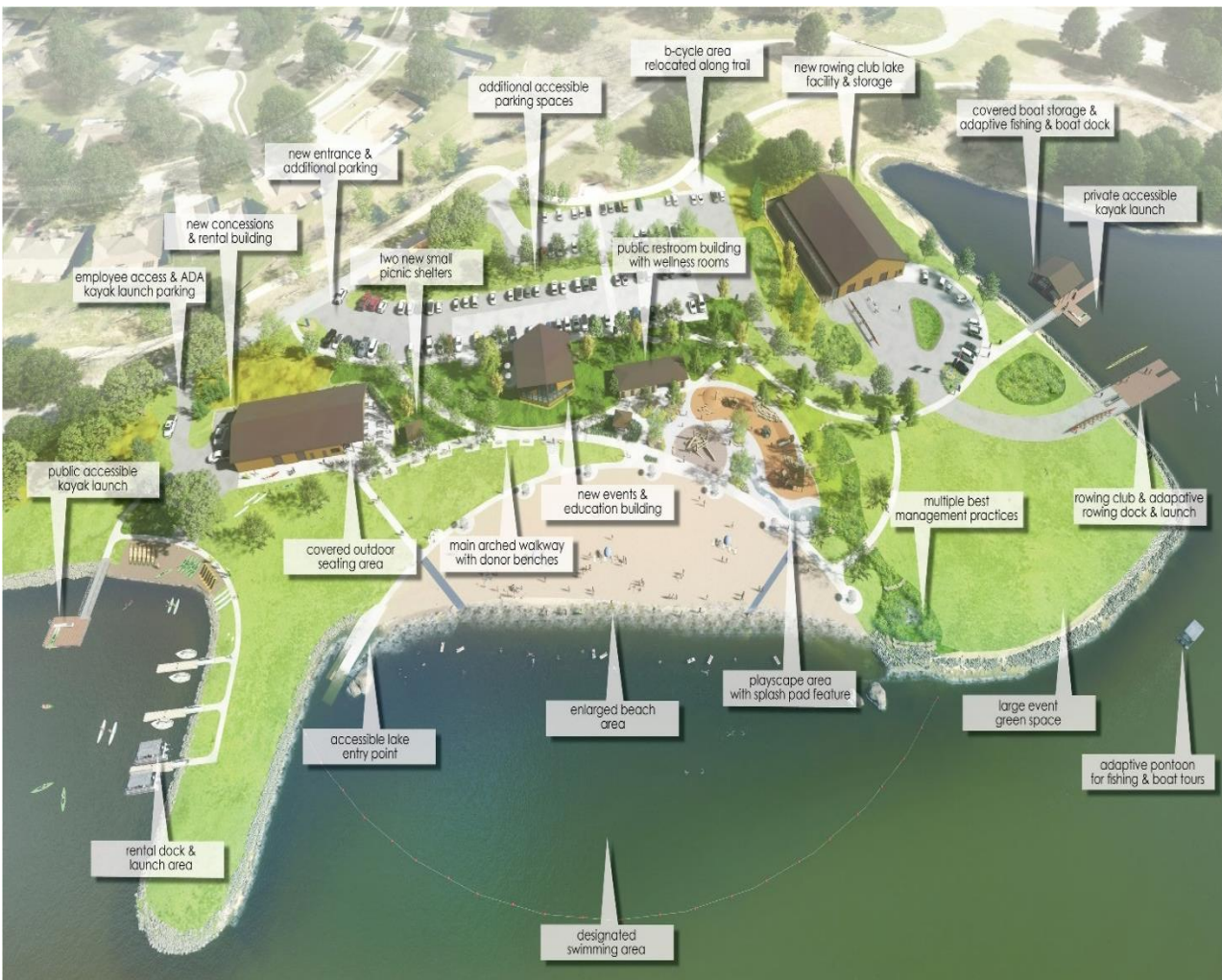
Rendering depicting the vision for the Athene North Shore Recreation Area Project