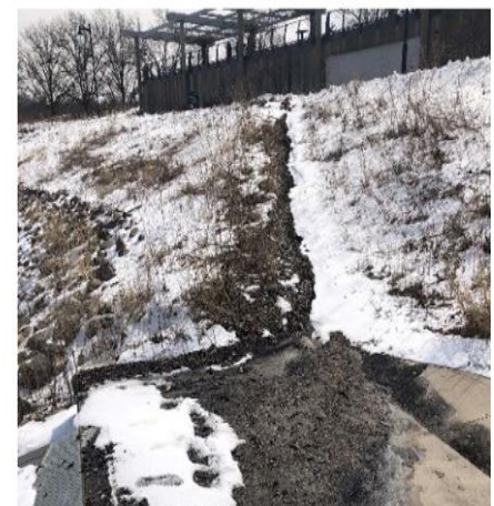
Damage from 2021-2022 Winter Season