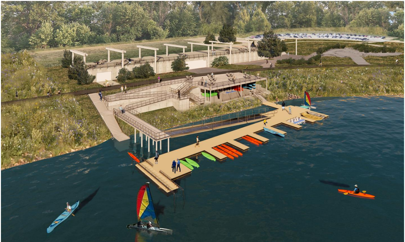
3D Model Rendering of Proposed Paddlecraft Marina Development