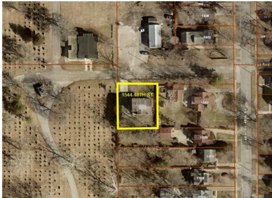
Map of 1544 48 TH STREET, Geoparcels 7924-31-401-030