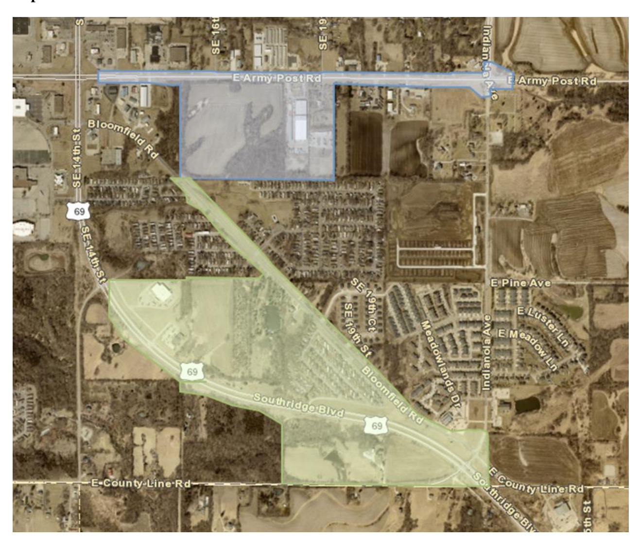
*Blue is the current East Army Post Road Urban Renewal Plan (approved 2022)