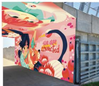
Proposed Mural Installation