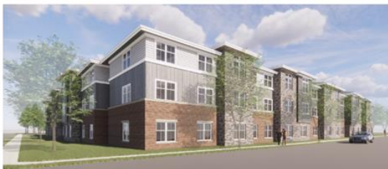
view from circle drive looking southeast