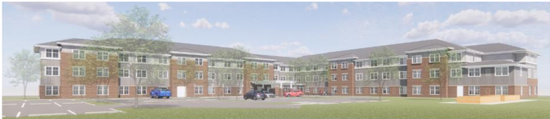
courtyard view looking northwest