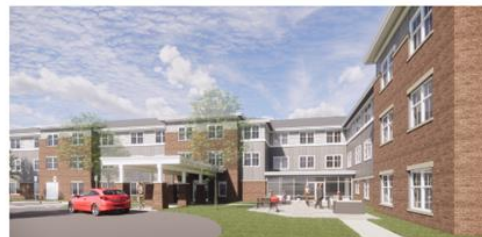
entrance canopy and patio