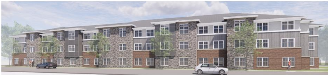
circle drive elevation