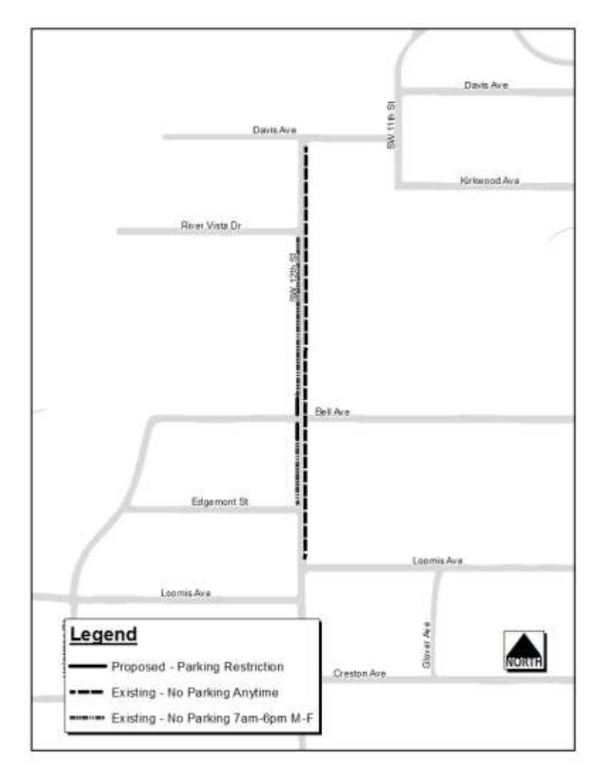
Sec. 114-2733. Southwest Twelfth Street-- Tuttle Street to Havens Avenue.

C. Parking is currently allowed on the west side of SW 12<sup>th</sup> Street from Davis Avenue to Watrous Avenue from 6:00 p.m. to 7:00 a.m., Monday through Friday and all day on Saturday and Sunday. A field review of the intersection indicated that vehicles parked on the west side of SW 12<sup>th</sup> Street north and south of Bell Avenue restrict visibility for eastbound drivers on Bell Avenue trying to enter the intersection. The proposed code change restricts parking at all times on the west side SW 12<sup>th</sup> Street for 50 feet both north and south of Bell Avenue. The following revisions to the Municipal Code are necessary to place these changes into effect.