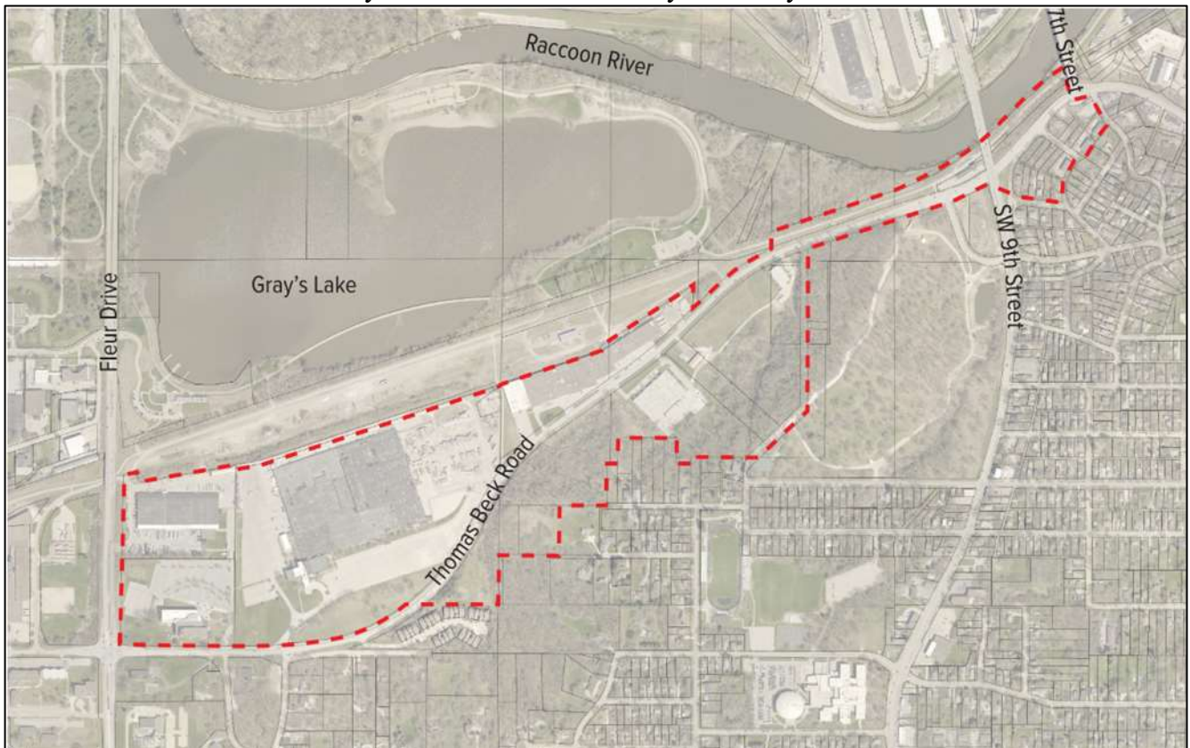
Gray's Lake Master Plan Study Boundary Area