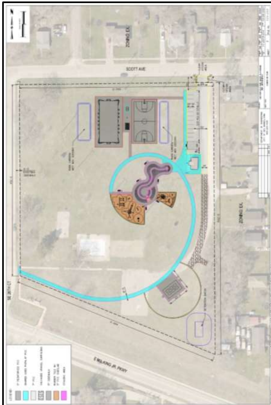
Construction Documentation Plan