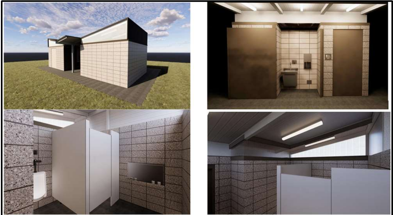
Witmer Park Phase 2 - Restroom Facility Renderings