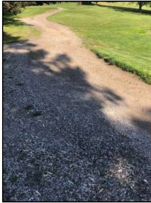
Grandview Golf Course Cart Path Current Conditions