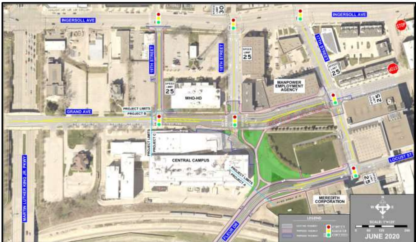
Exhibit Above: Recommended Concept Plan for area of 18th Street, Grand Avenue, and Locust Street.

*Note: After the above exhibit was created and the public meeting was held on December 15, 2020, the City determined to extend the one-way to two-way conversion of Grand Avenue and Locust Street